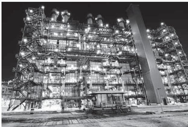
A view of Naphtha Cracker Unit at Panipat

"...Indian economy is no longer isolated from its global counterparts. The aftermath of global recession was clearly visible in the country's subdued GDP growth rate of 4.7 per cent in 2013-14 (2012-13: 4.5 per cent, 2011-12: 6.7 per cent), with declining industrial performance particularly attributable to mining and manufacturing sectors."