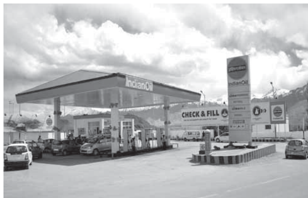
India's highest altitude Retail Outlet at Leh

IndianOil set up its Business Development group in 1997 with a view to expand its business activities across the hydrocarbon value chain and achieve vertical integration by entering both upstream and downstream verticals. Within a short span of time, it has been able to establish itself in the downstream petrochemicals business by setting up modern,