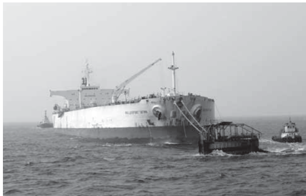
Crude Carrier discharging into IndianOil SPM

and supply disruptions in Libya impacted the oil prices in the second quarter of FY13-14. However, prices of crude oil came down subsequently with improvement of the situation in Syria and partial restoration of oil supplies from Libya, together with positive news of hydrocarbons production from non-conventional resources in US. The average prices of crude oil in the international market fell in 2013-14, with Brent price moderating to USD 107.6 per barrel (bbl) from USD 110.1/bbl in 2012-13. The average price of the Indian crude basket too came down from USD 108/bbl in FY12-13 to USD 105.5/bbl in FY13-14.