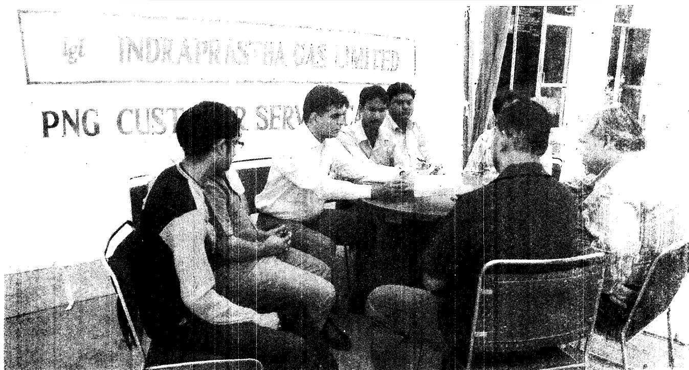
A PNG Customer Service Camp in progress

The Directors also acknowledge the support of all the Local Authorities, Bankers, Media, Station Operators & their employees, contractors, vendors and suppliers.