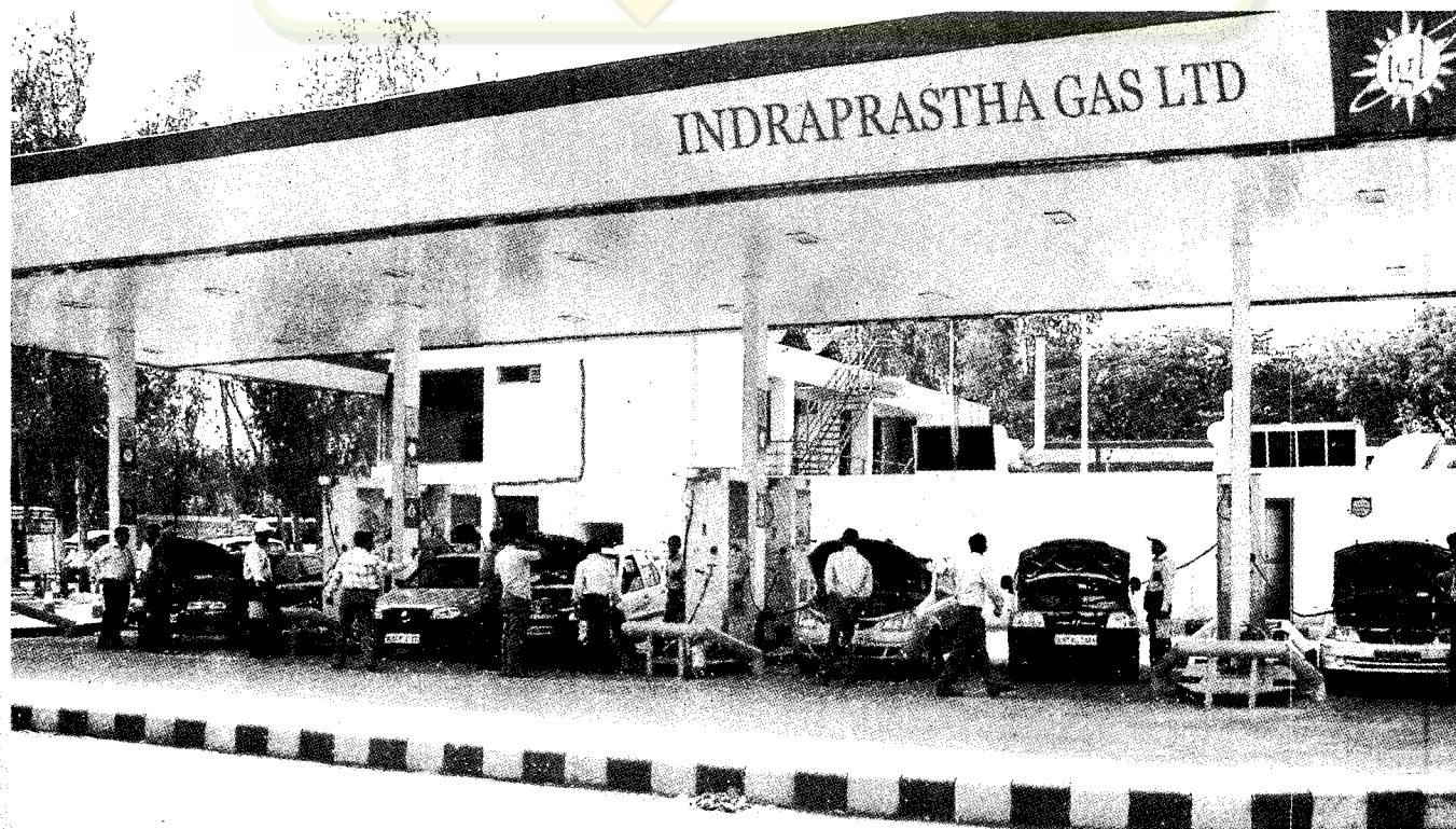
A View of Mega CNG Station at Jail Road