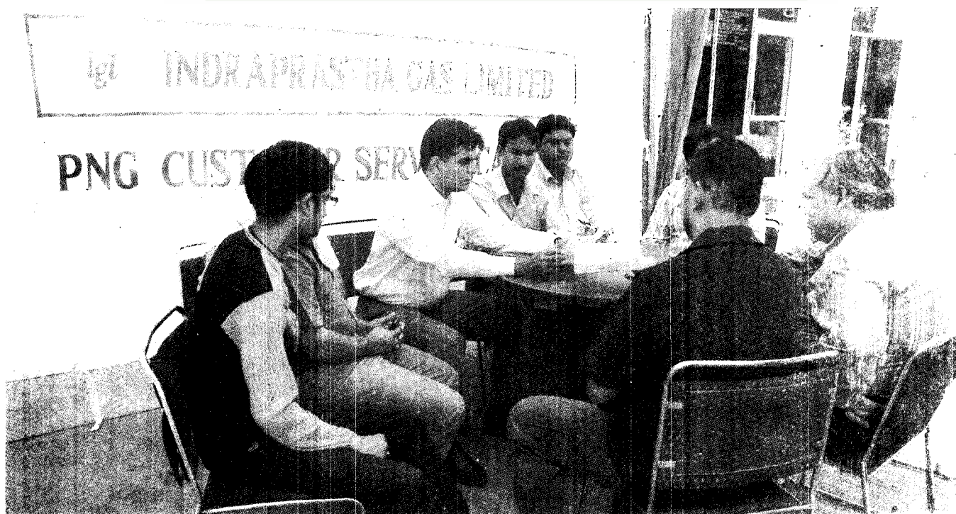
A PNG Customer Service Camp in progress

The Directors also acknowledge the support of all the Local Authorities, Bankers, Media, Station Operators & their employees, contractors, vendors and suppliers.