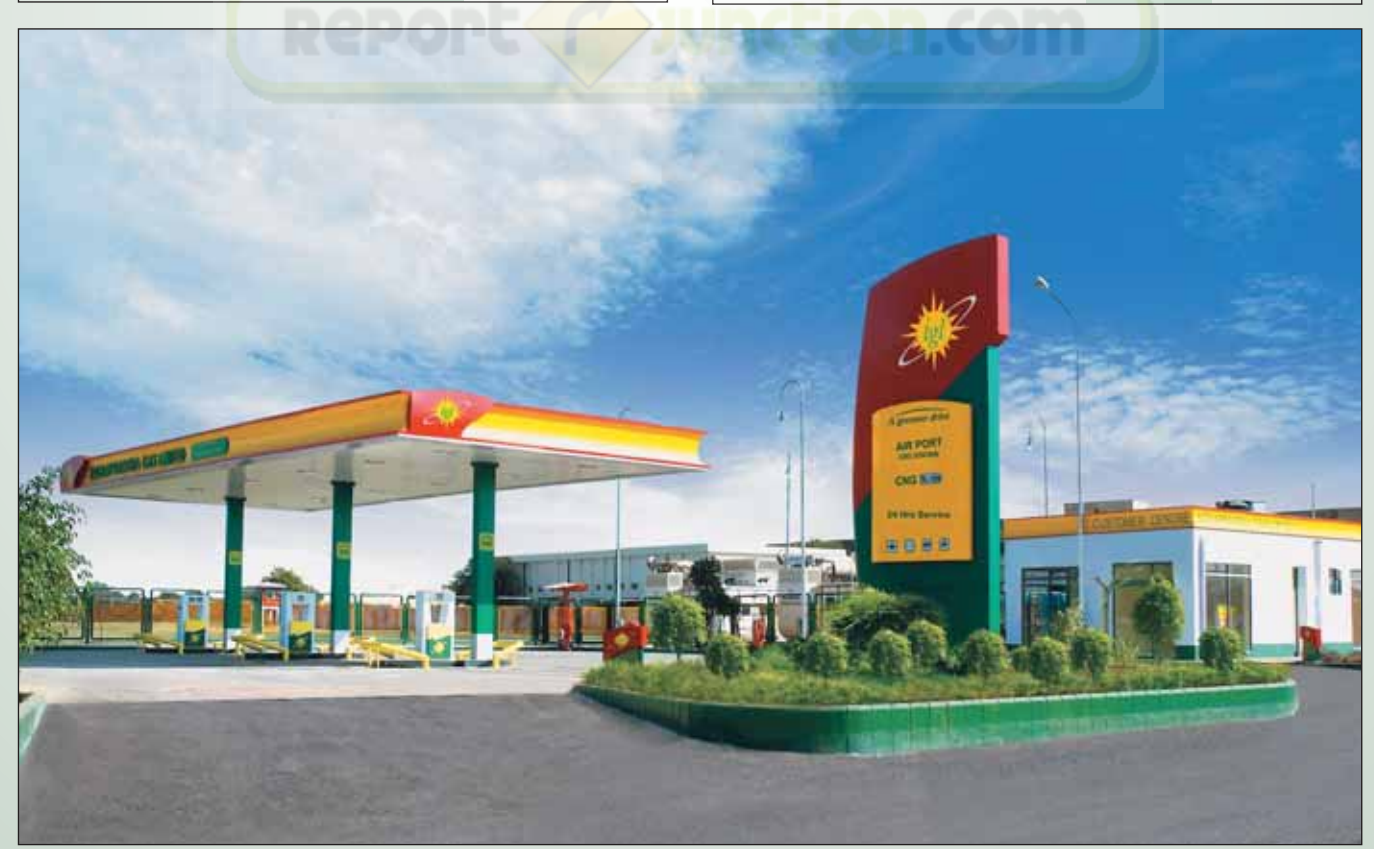
The new look CNG Station of IGL with a new colour scheme inside IGI Airport premises.