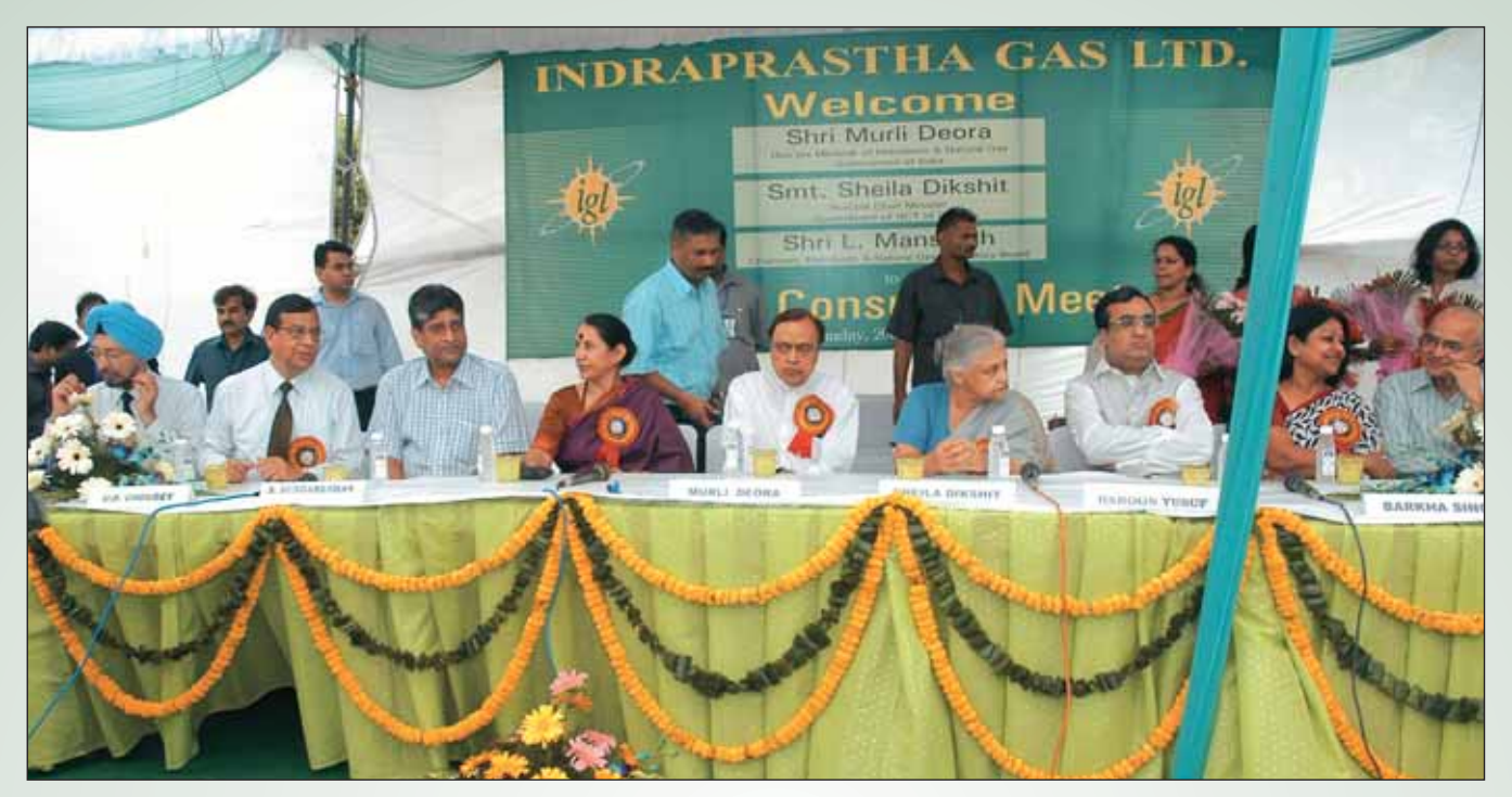
Shri Murli Deora, Hon'ble Union Minister of Petroleum & Natural Gas and Smt. Sheila Dikshit, Hon'ble Chief Minister of Delhi alongwith other dignitaries at the CNG Consumer Meet organised by IGL.