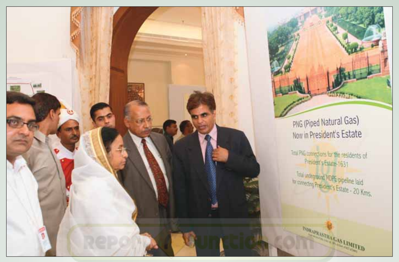
Smt Pratibha Devi Singh Patil, Hon'ble President of India gets a briefing on the progress of PNG project in the Presidential Estate residential quarters.

to convert to CNG mode. In view of the expected growth in demand, the Company has drawn up an ambitious plan to augment its infrastructure by adding 22 new CNG stations in 2009-10.