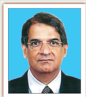
Shri S. Radhakrishnan Chairman