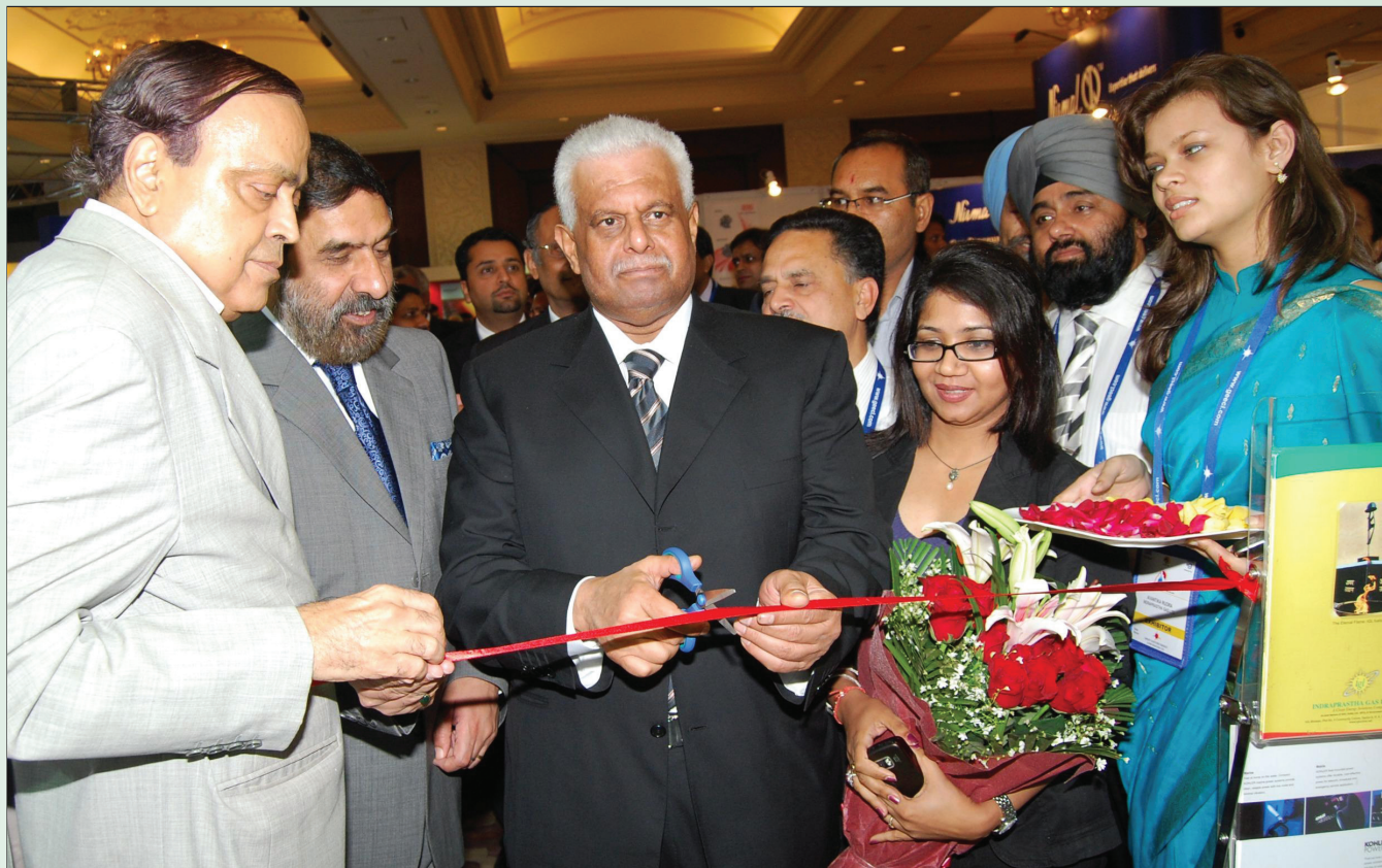
Shri Abdullah Bin Hamad Al-Attiyah, Hon'ble Dy Premier and Minister of Energy & Industry of Qatar inaugurating IGL Stall at 6 th Asia Gas Partnership Summit in the august presence of Shri Murli Deora, Hon'ble Union Minister of Petroleum & Natural Gas and Shri Anand Sharma, Hon'ble Union Minister of Commerce & Industry.

CNG being an eco-friendly and economical fuel, a large number of private car manufacturers are introducing their CNG variants. Due to wide acceptance of CNG, there has been a large-scale conversion of private cars into CNG mode. This segment will give a boost to CNG sales in the coming years.