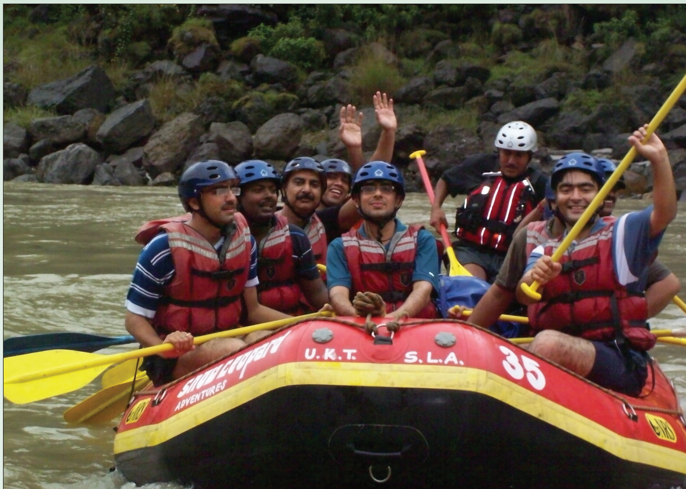
IGL employees participating in out-bound training programme for team building.

of the financial year and of the profit of the Company for the year under review;