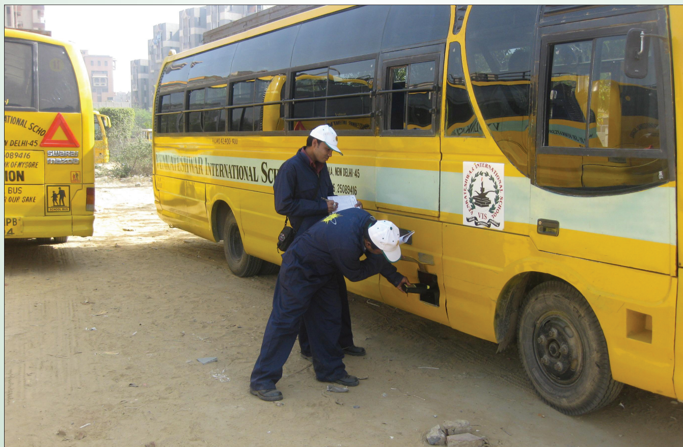
Fire and Safety team of IGL checking school buses to ensure compliance of safety measures.

Core Safety Group comprising trained & qualified Company executives of multi-disciplines from all control rooms was imparted internationally accredited safety training from NEBOSH, UK. Safety Clinics alongwith practical demonstrations / training to operate portable fire extinguishers are regularly carried out at consumer premises. For better understanding and to further improve quality of training module, the Company is intending to depute a dedicated group of trainers with fully equipped Training Van to cover each and every sector of consumers, contract workers and employees. Also in line with the commitment for safety of CNG consumers and energy conservation, safety checks of CNG propelled cars were carried out through free service camps of CNG Kits across NCT of Delhi.