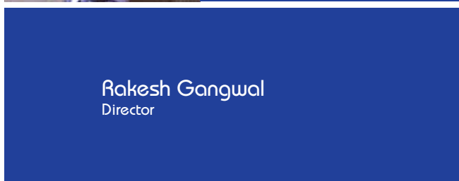
Rakesh Gangwal Director