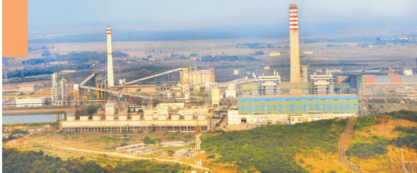
Integrated Stainless Steel Plant, Odisha