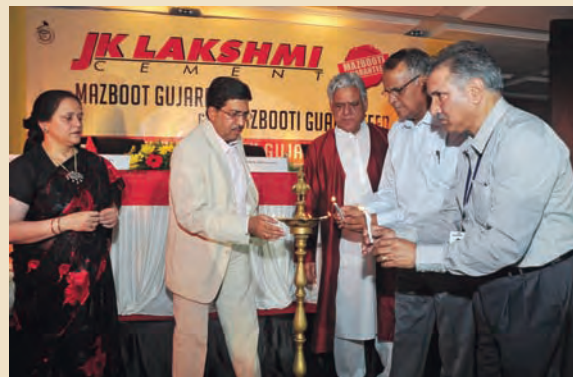
Mr. Om Puri, our Brand Ambassador with the MD and other company officials at the launch event held at Ahmedabad.