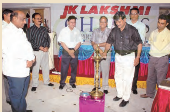
Lighting of the lamp at the launch of JK Lakshmi Champs- Winning Together, a CRM programme for channel partners.