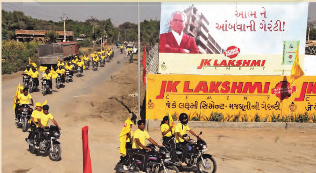
Gujarat plant inauguration - Rallies from our different markets of Gujarat.