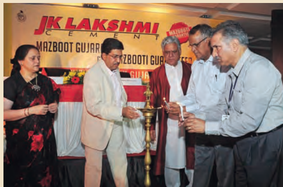
Mr. Om Puri, our Brand Ambassador with the MD and other company officials at the launch event held at Ahmedabad.