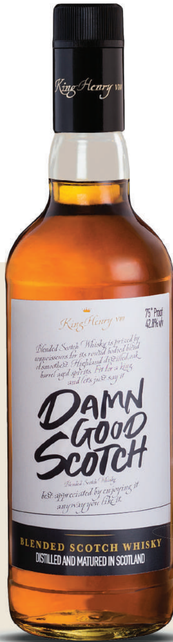
King Henry Damn Good Scotch