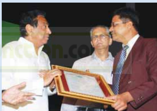
APEDA Certificate was received by Shri V.P. Patil from Shri Kamal Nath, Hon'ble Minister for Commerce & Industries, Govt. of India, in presence of Shri Gopal K. Pillai, Secretary, Ministry of Commerce and Industry, Govt. of India.