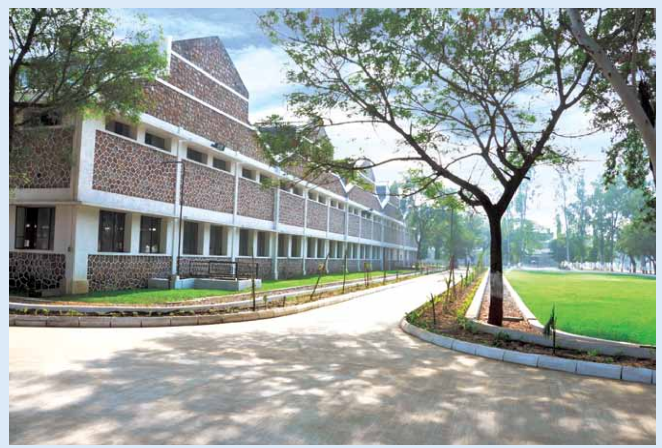
Drip / Sprinkler Irrigation Systems and Plastic Piping : Jain Plastic Park, Alwar, Rajasthan (India)