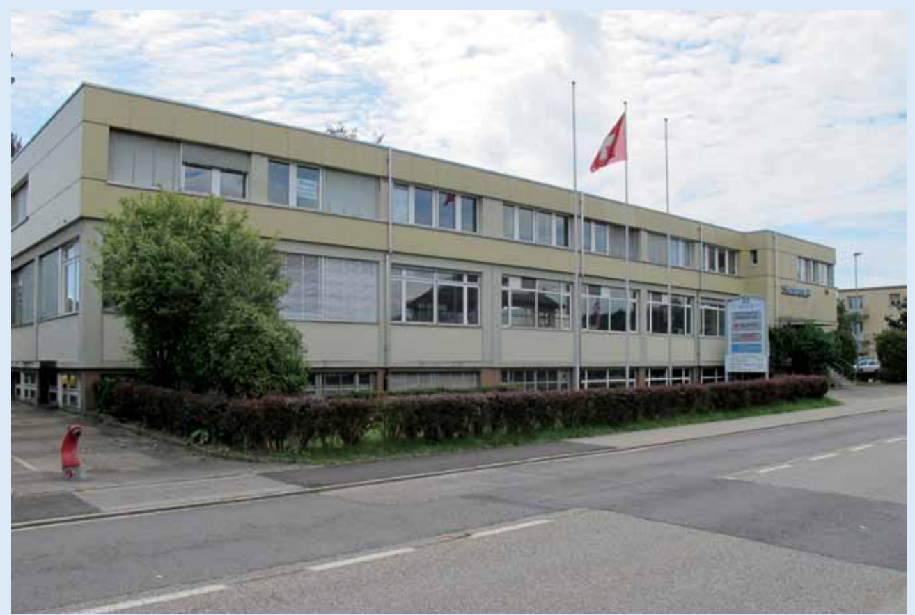
HiTec Injection Molds & Hortunner Systems : Protool, Switzerland