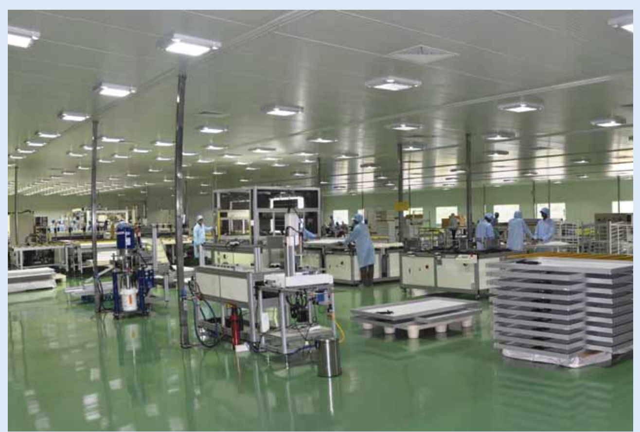
Solar Photovoltaic Module : Jain Energy Park, Jain Valley, Jalgaon, Maharashtra (India)