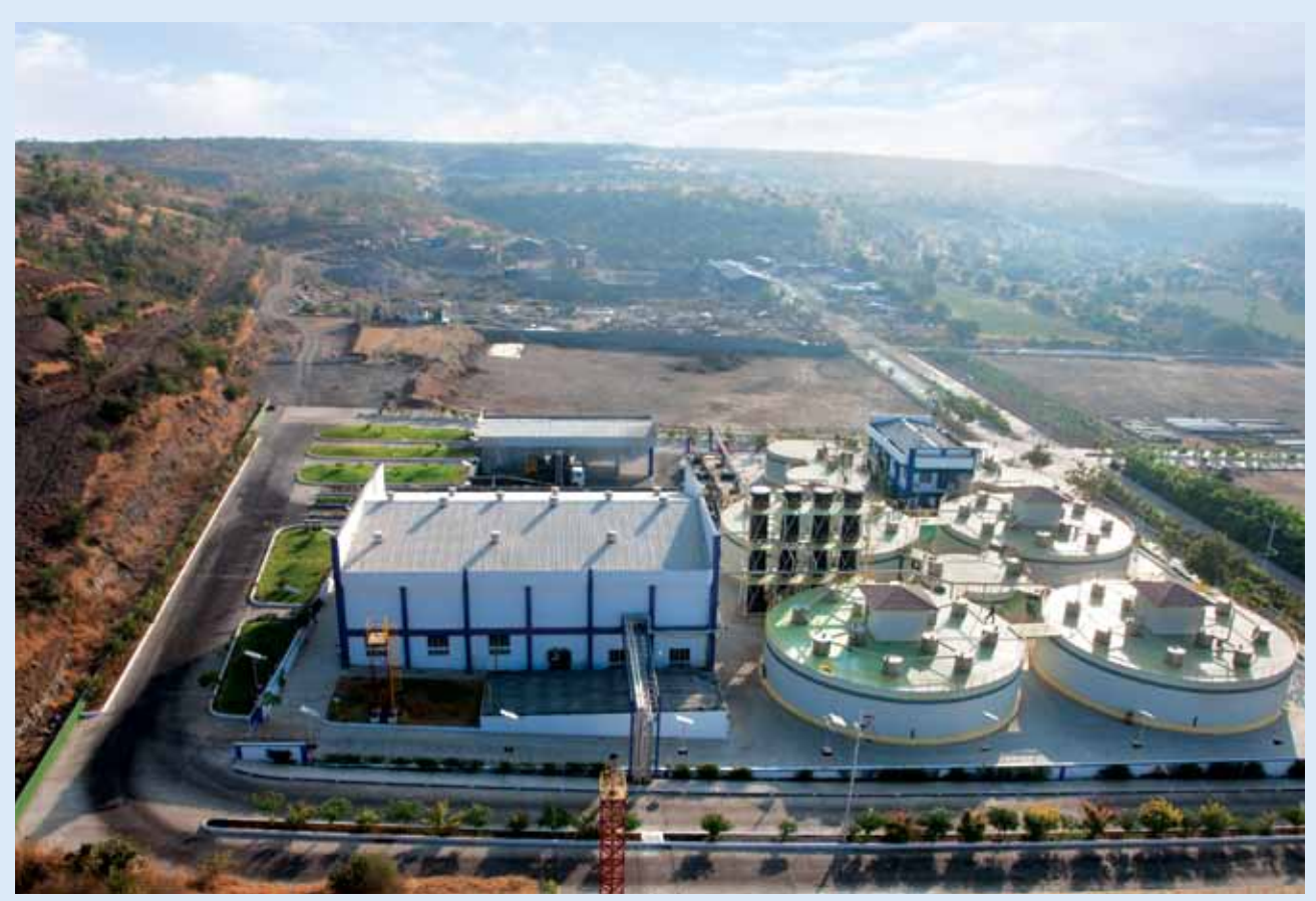
Biogas : Jain Energy Park, Jain Valley, Jalgaon, Maharashtra (India)