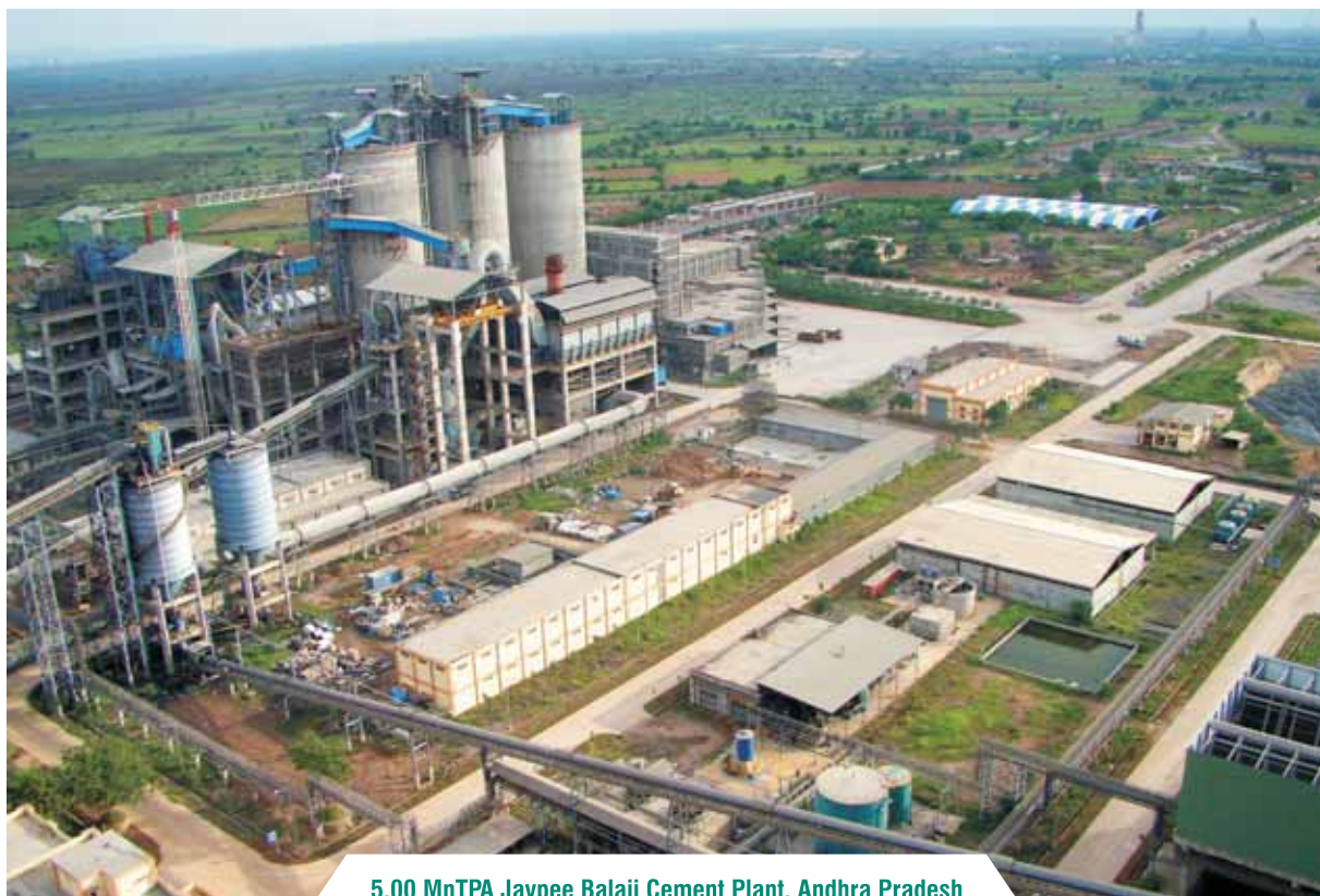
5.00 MnTPA Jaypee Balaji Cement Plant, Andhra Pradesh