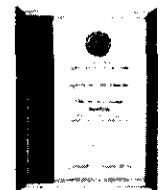
Green Globe Achievement Award 2000