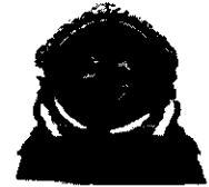
Dr. M S Swaminathan Award 2000