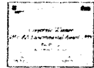
IH&RA Environmental Award 1999