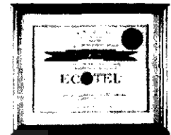
ECOTEL® Industry Pioneer Status 1999