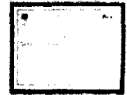
IH&RA Green Hotelier Award 1999