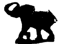
IH&RA Environment Award 1999