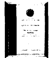
Green Globe Achievement Award 2000