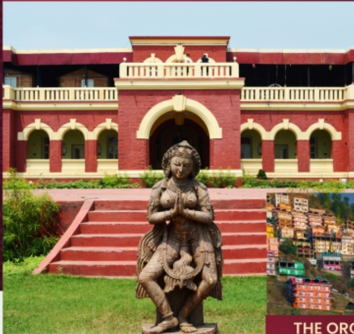
MAHODADHI PALACE - PURI