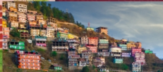
THE ORCHID HOTEL - SHIMLA