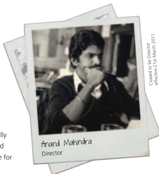
Anand Mahindra Director

Anand Mahindra @25: Successfully finished my first year at the Harvard Business School; got the class prize for highest ROE: Return on Effort!