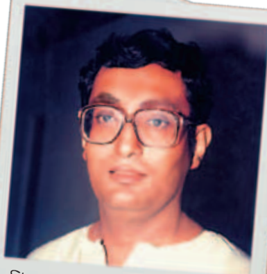
Shivaji Dam Director