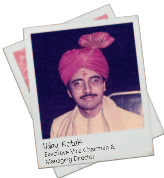
Uday Kotak Executive Vice Chairman & Managing Director