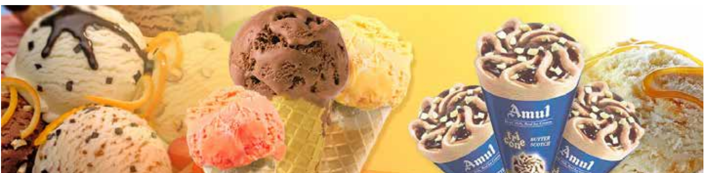
Rolled Sugar Cones for Ice Cream