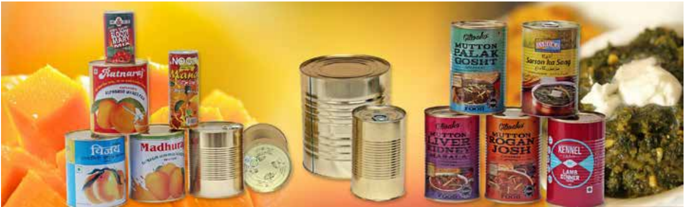
Cans for Processed Food