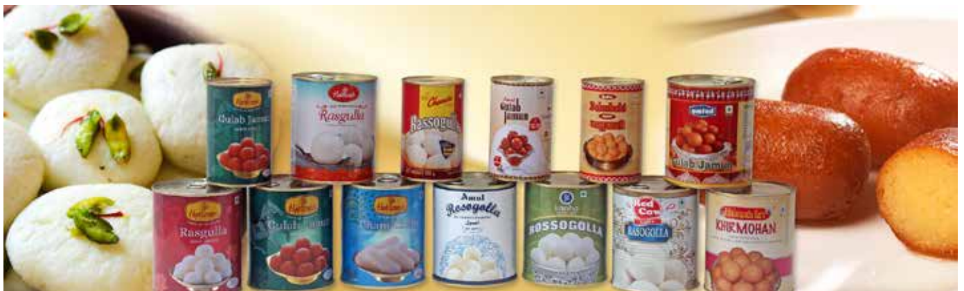
Cans for Sweets