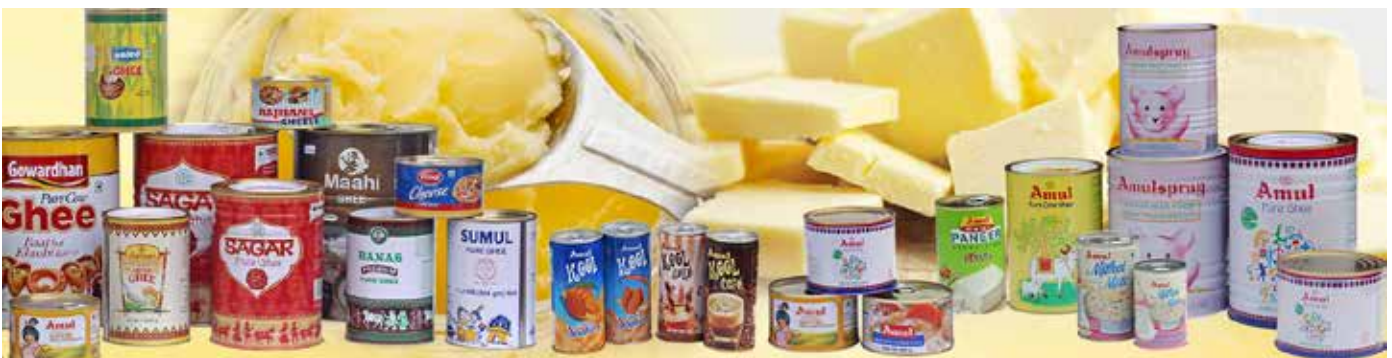
Cans for Dairy Products