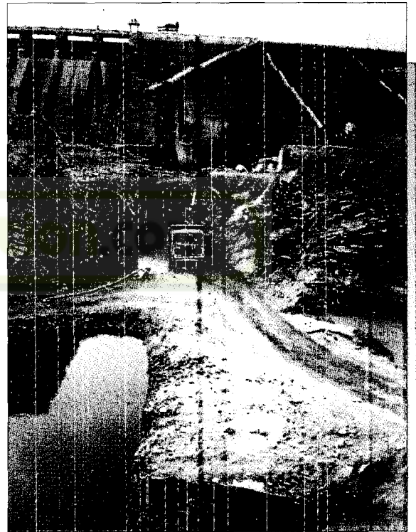
Aliyar 2 x 1250 kW : Mini Hydel Project - Excavation for Power House in progress