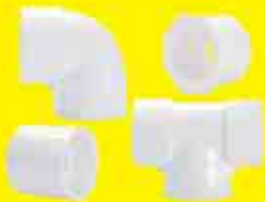
HIGHER DIAMETER ASTM FITTINGS