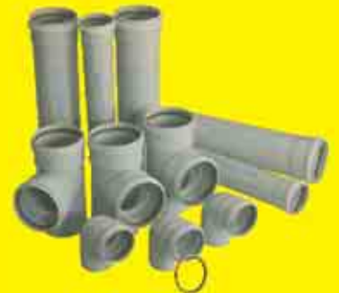
PERMAFIT RANGE OF SWR PIPES & FITTINGS WITH CO-MOULDED RINGS