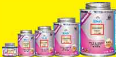
NEW TINS FOR PVC SOLVENT CEMENT