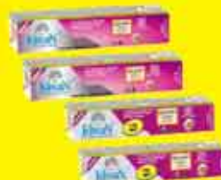
15 & 10 ML RETAIL PACKS