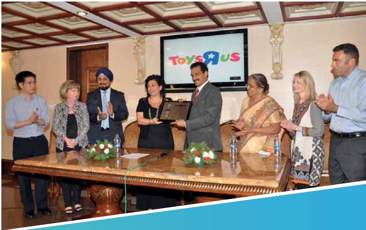
CMD getting an award from ToysRus for Vendor of The Year