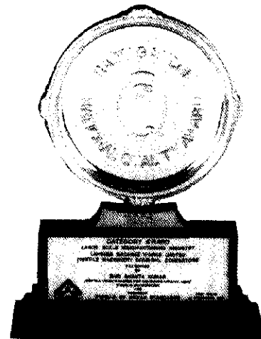
Rajiv Gandhi National Quality Award - 1999