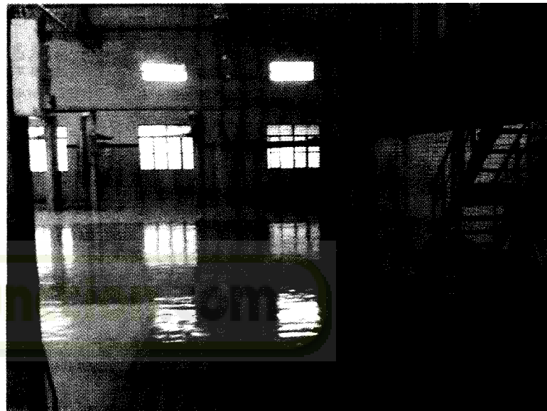
MRF Epidec-Epoxy flooring at a modern workshop in Bangalore