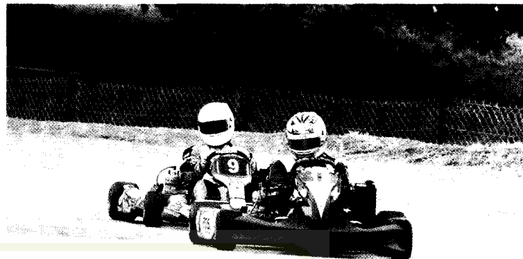
MRF tyres – popular in Malaysian Karting Circuits