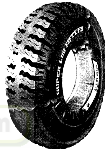
MRF SuperLug50-FS Fuel efficient bias truck tyre