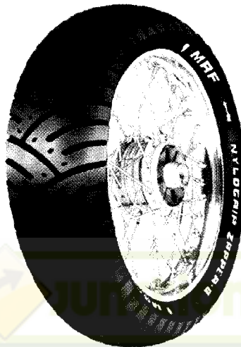
Nylogrip Zapper Q for new generation bikes