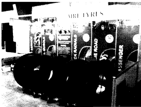
MRF display at an exhibition in Canada