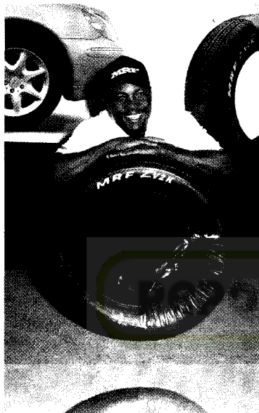
Brian Lara at the launch of V-rated Radial Tyres