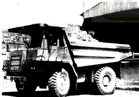
MRF's Muscle Rock tyres for mining operations, plying in Australia