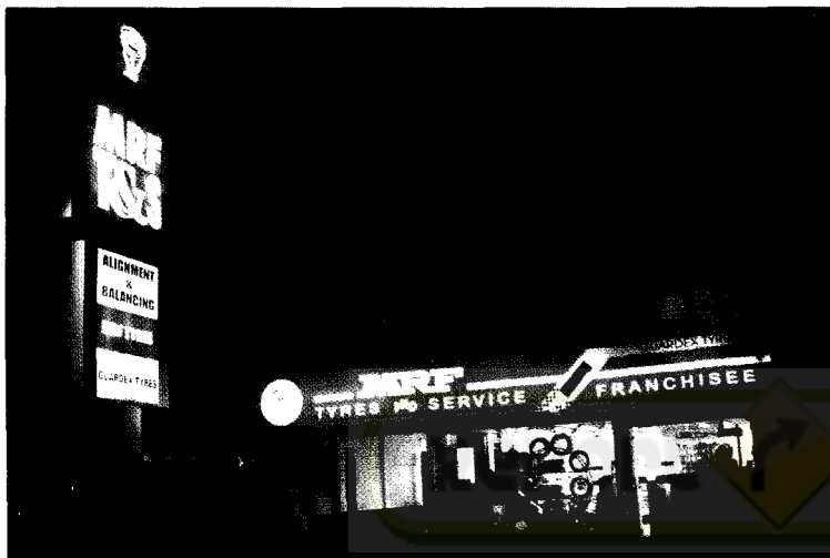
Hi-Tech MRF's T&S Showroom at Mumbai