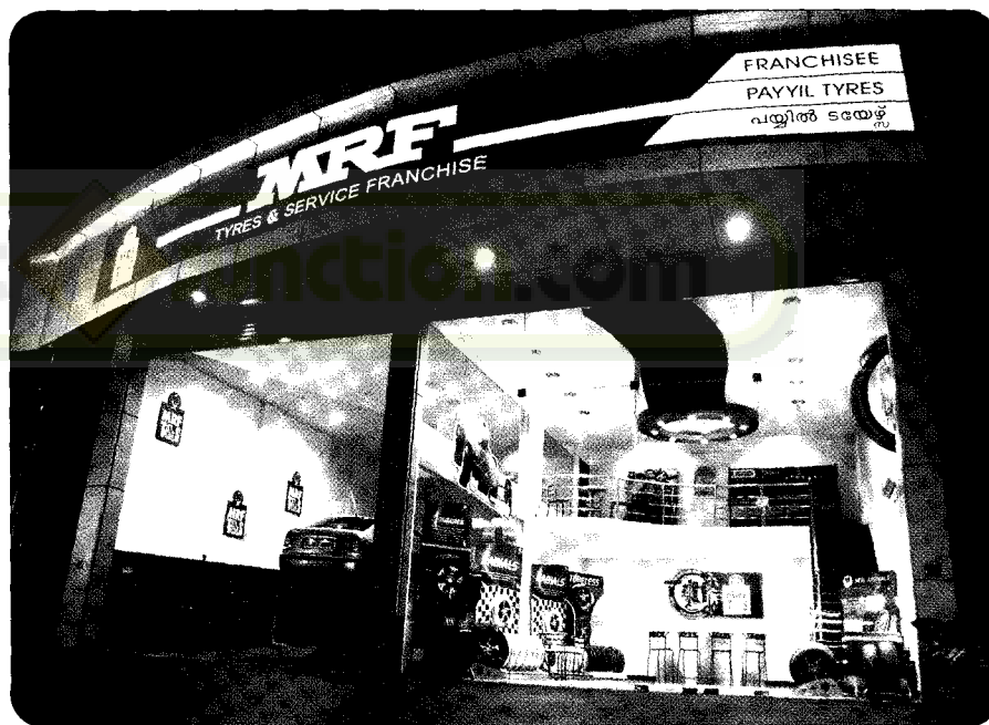
A view of the new MRF T&S showroom.

The MRF T&S (Tyres and Service) outlets were refurbished to serve the customer better. T&S outlets stock the entire range of MRF tyres and are equipped to provide services like computerized wheel alignment, wheel balancing and tyre changing for passenger cars.