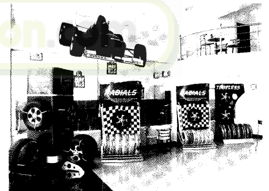
MRF T&S showrooms – world-class layout ▶