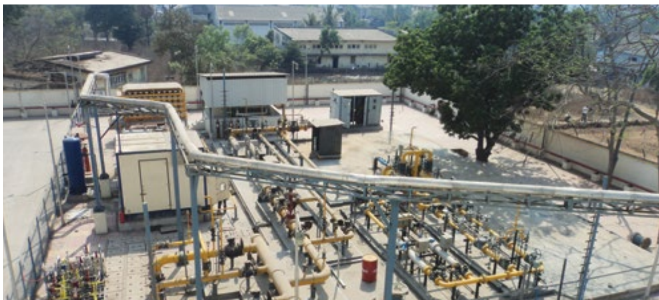
City gas Station at Ambernath

India is one of the largest energy consumers of the world after China with a rapid growth in energy consumption since the past decade. With increase in use of environmentally clean fuels, natural gas is expected to play a dominant role in the country's energy spectrum. Typically, CNG and PNG provide more benefits when compared to liquid fuels as they offer higher fuel efficiency to the customers.