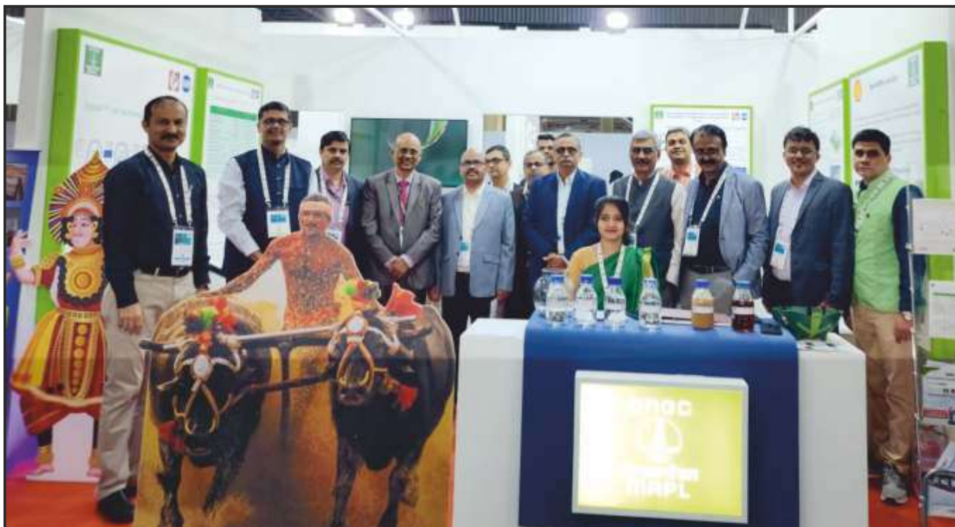
MRPL at India Energy Week 2023