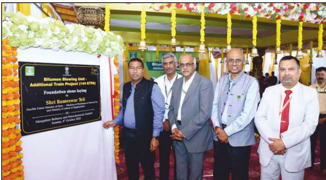
Laying of foundation stone by Shri Rameshwar Teli, Hon'ble Union Minister of State - (MoP&NG) for Bitumin Blowing Unit