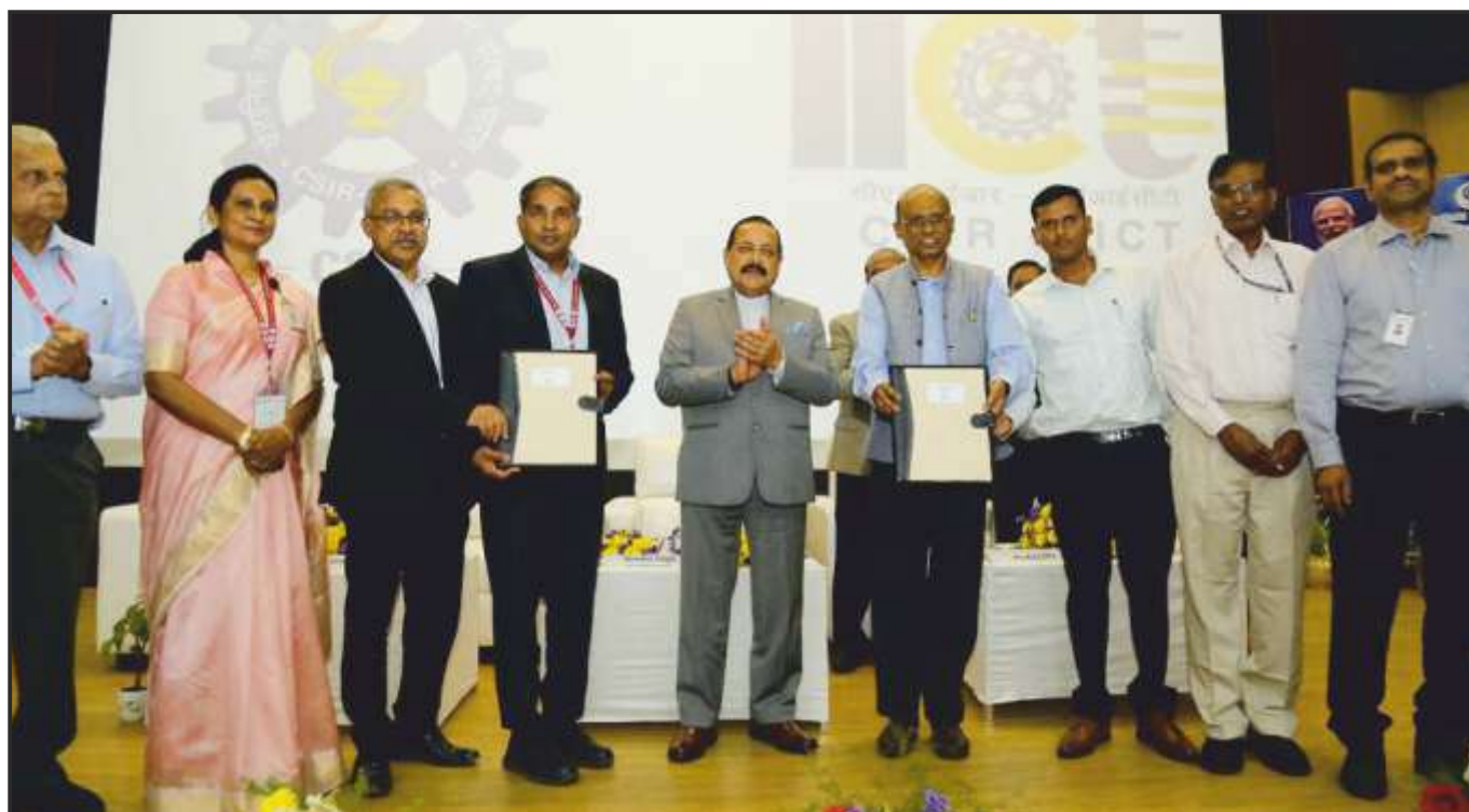
CSIR IICT signs Research pact with Mangalore Refinery and Petrochemicals Limited (MRPL)