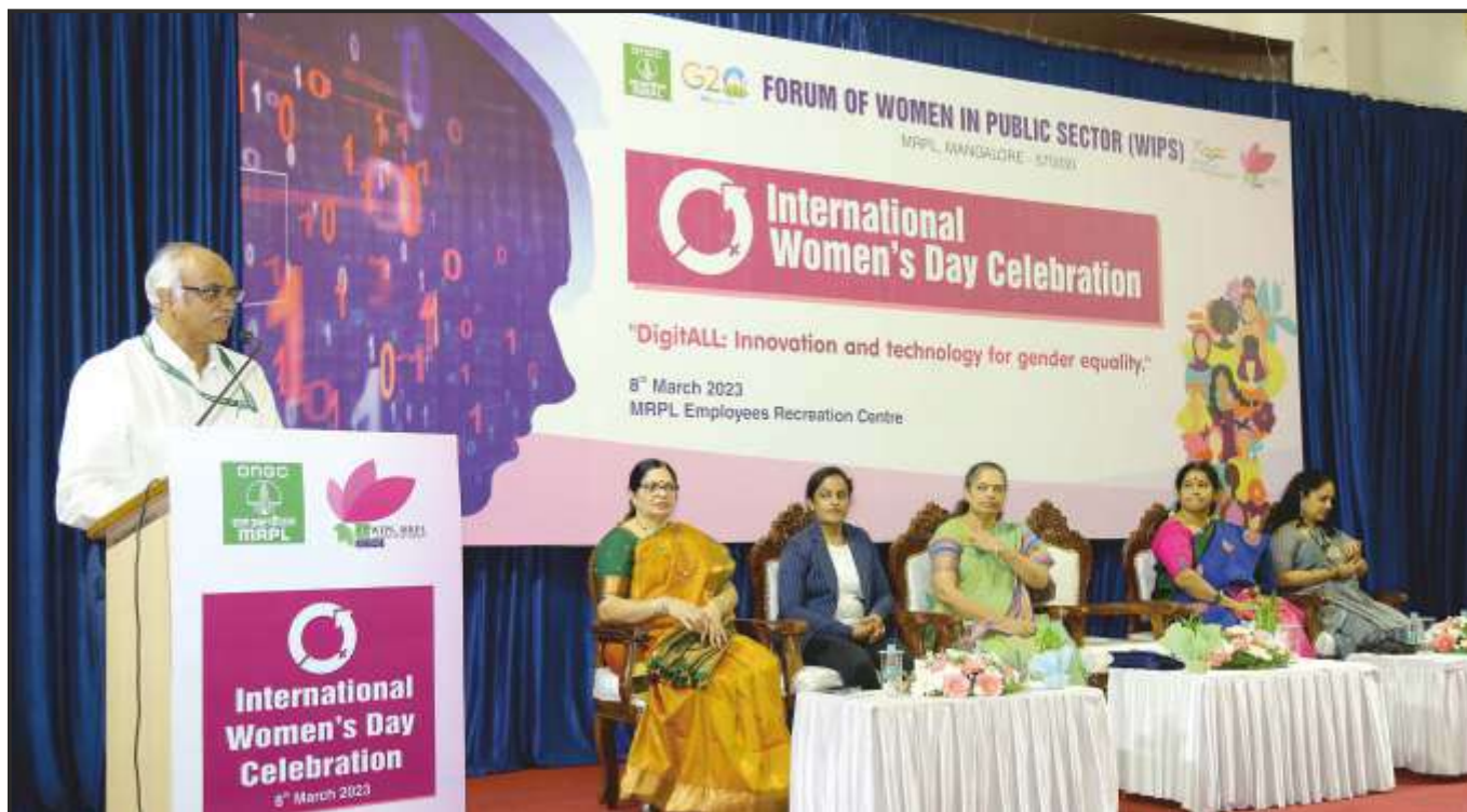
International Women's Day Celebration at MRPL