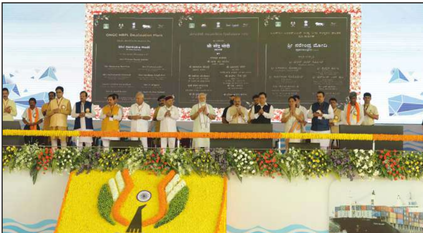
Inauguration of De-salination Plant by Hon'ble Prime Minister Shri Narendra Modi