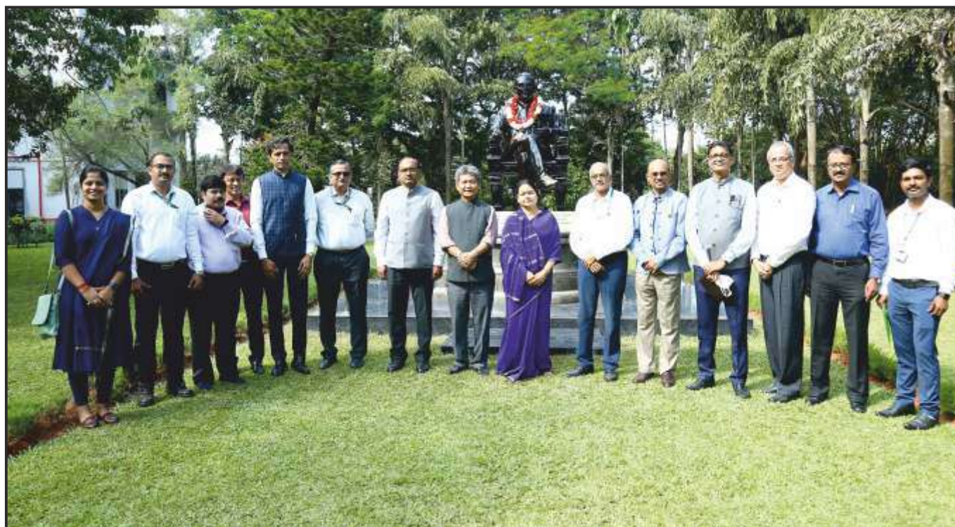
NCST Secretary visit to MRPL