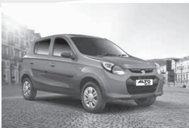
Alto 800 (also available Alto K10)