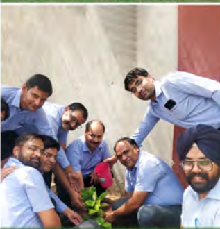
TEAM - JAIPURA