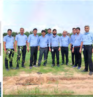
JAIPURA SCHOOL GROUND