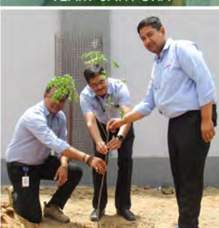
TEAM - DHODSAR