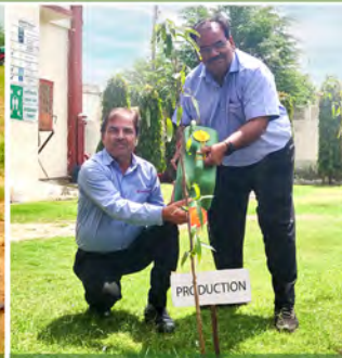
TEAM - JAIPURA