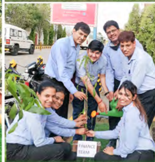
TEAM - JAIPURA