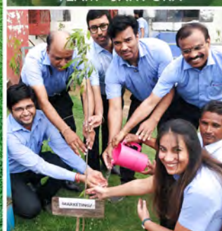
TEAM - JAIPURA