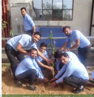
TEAM - JAIPURA