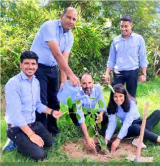
TEAM - DHODSAR