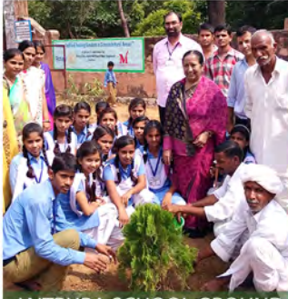
JAIPURA SCHOOL GROUND