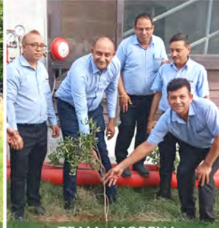
TEAM - MORENA