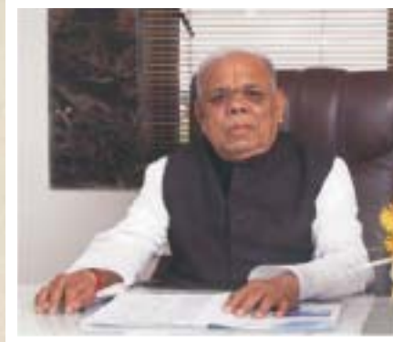
Chairman, Murli Industries Limited