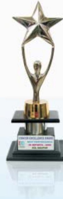
CONCOR Excellence Award for Best Performance in Imports 2009-10