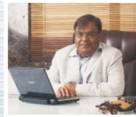
Managing Director, Murli Industries Limited Director, SOPA Ex. Dy. Chairman, SOPA

Some key figures in the Company are instrumental in taking the Company to the summit of greatness scaled by it toady. Our 56-year old Managing Director who knows the ins and outs of complex industrial operations and whose genius is unrivalled in business circles is unquestionably an extremely important part of MIL think-tank having given a definitive direction to the MIL expansion campaign currently underway.