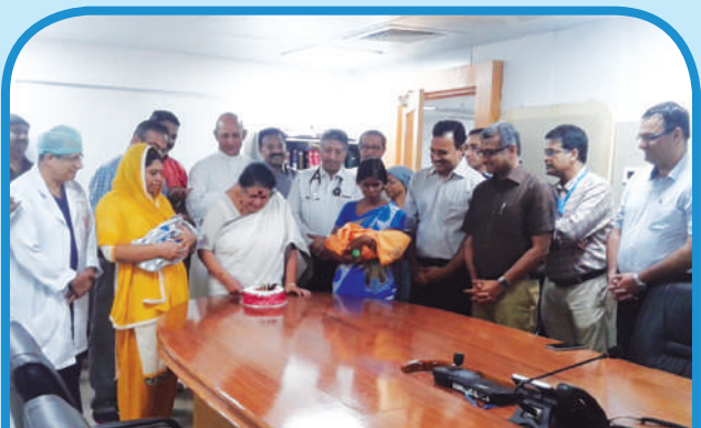
Send off programme on December 09, 2017 for the children who completed the surgery at Lisie Hospital supported by MCSL