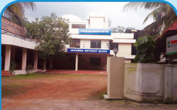
Aashiana Rehabilitation Centre Vettickal - Mulanthuruthy