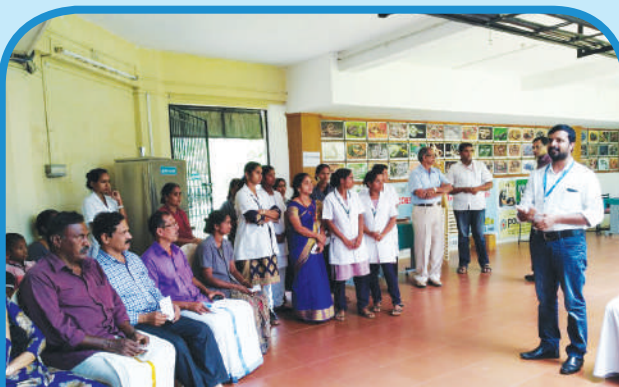
Medical Camp organised at Palakkad on March 24, 2018 in association with Palana Hospital, Palakkad and Lisie Hospital, Ernakulam