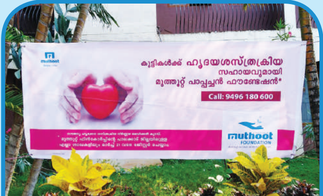
Medical Camp at Palakkad