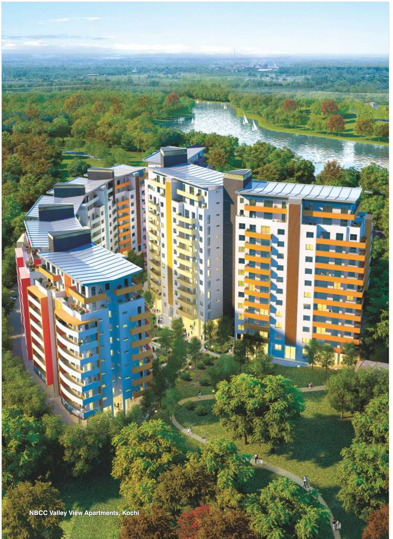
NBCC Valley View Apartments, Kochi