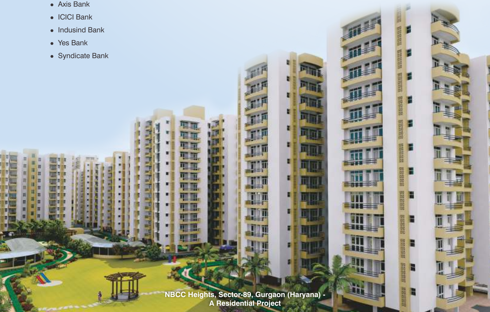
NBCC Heights, Sector-89, Gurgaon (Haryana) - A Residential Project

M/s Bigshare Services Pvt Ltd. 4E/8, 1st Floor, Jhandewalan Extension New Delhi - 110055