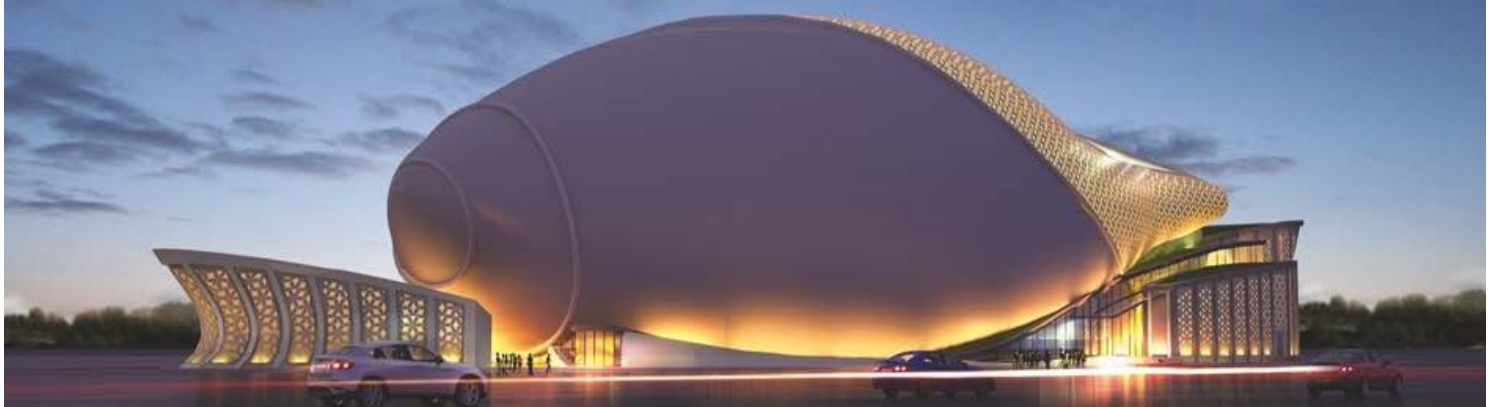
2400 Seater Auditorium, Kolkata (Perspective View)