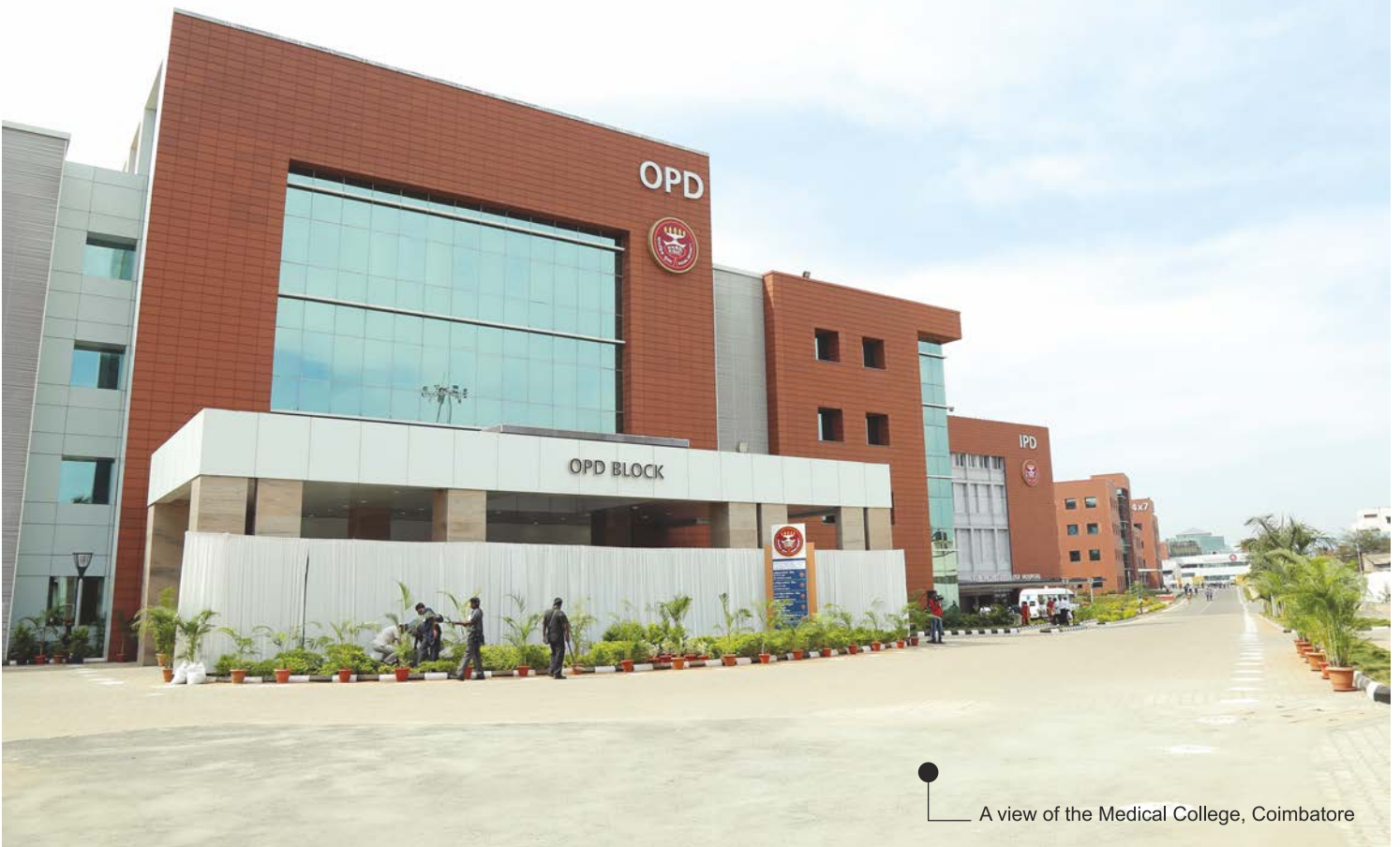
A view of the Medical College, Coimbatore