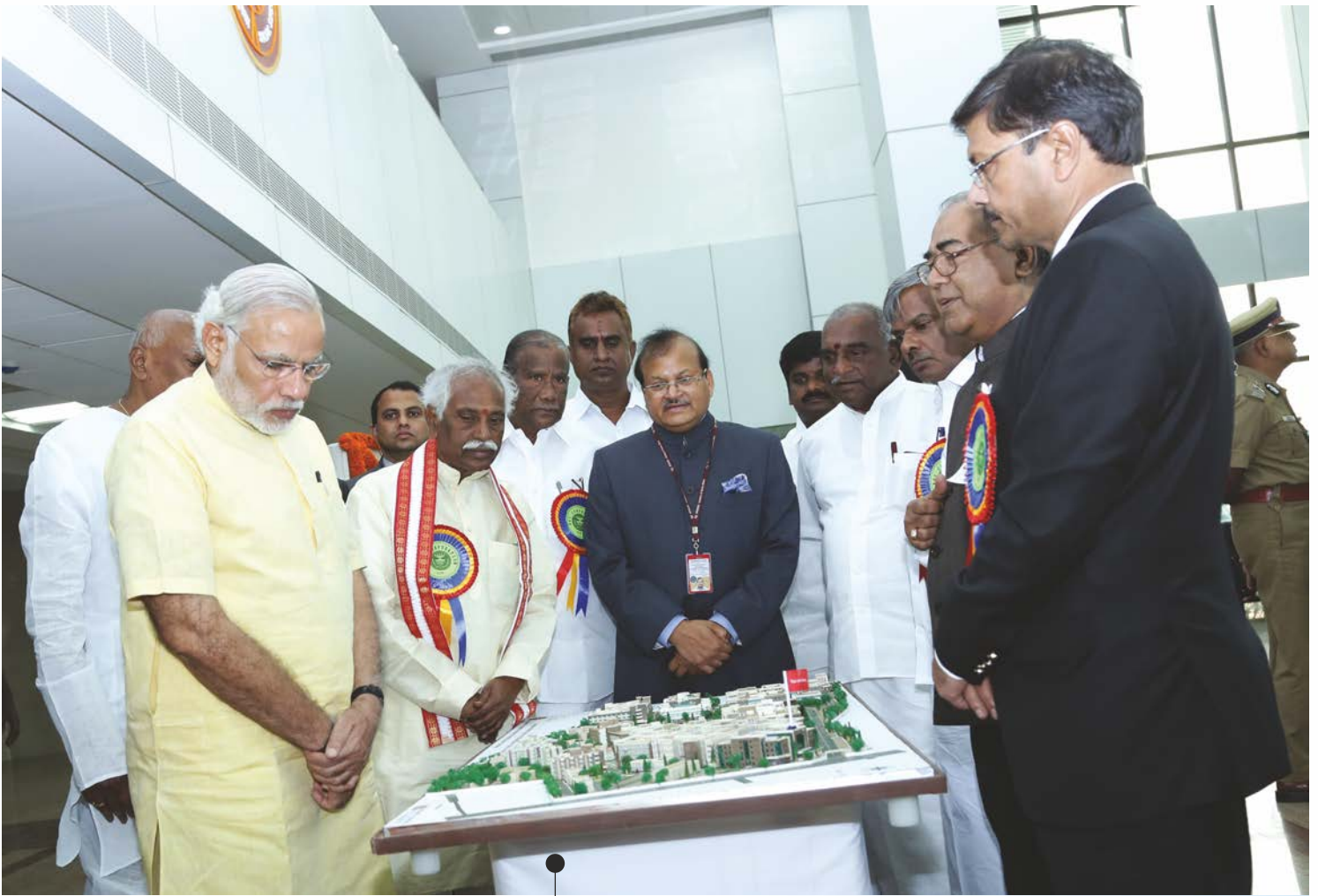
Shri. Narendra Modi, Hon'ble Prime Minister of India, inaugurates ESIC Medical College & Hospital at Coimbatore, Tamil Nadu, executed by NBCC