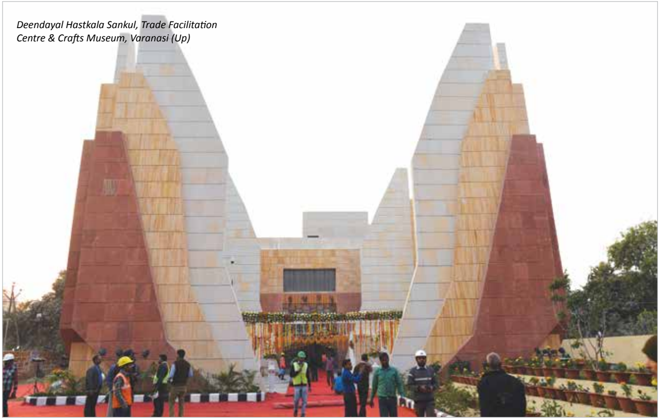
Deendayal Hastkala Sankul, Trade Facilitation Centre & Crafts Museum, Varanasi (Up)