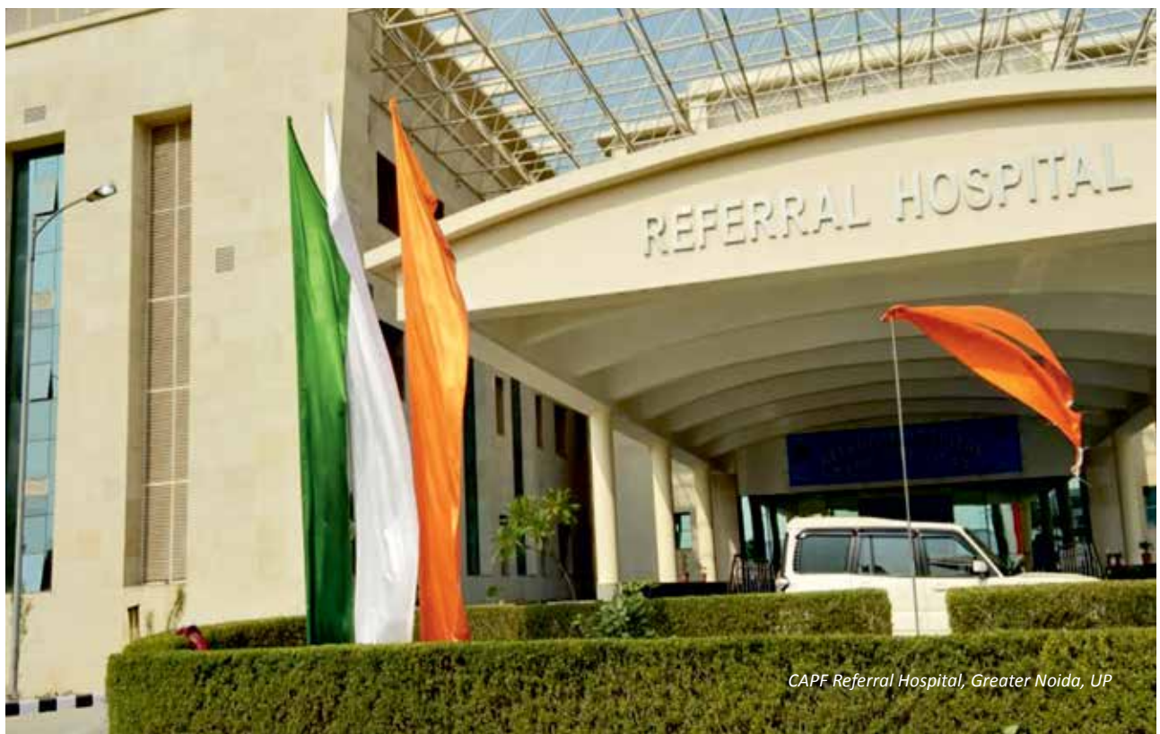
CAPF Referral Hospital, Greater Noida, UP