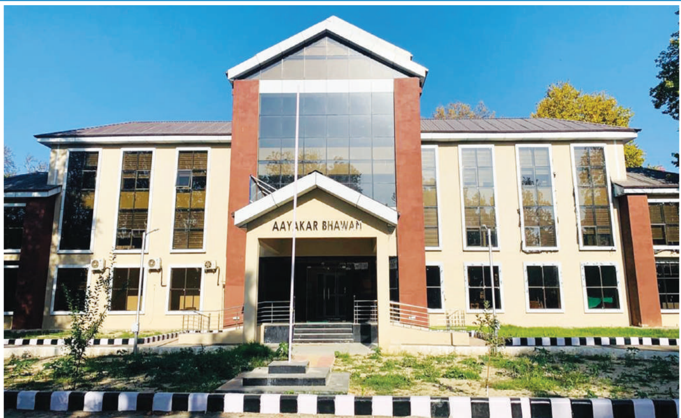
Aayakar Bhawan, Srinagar