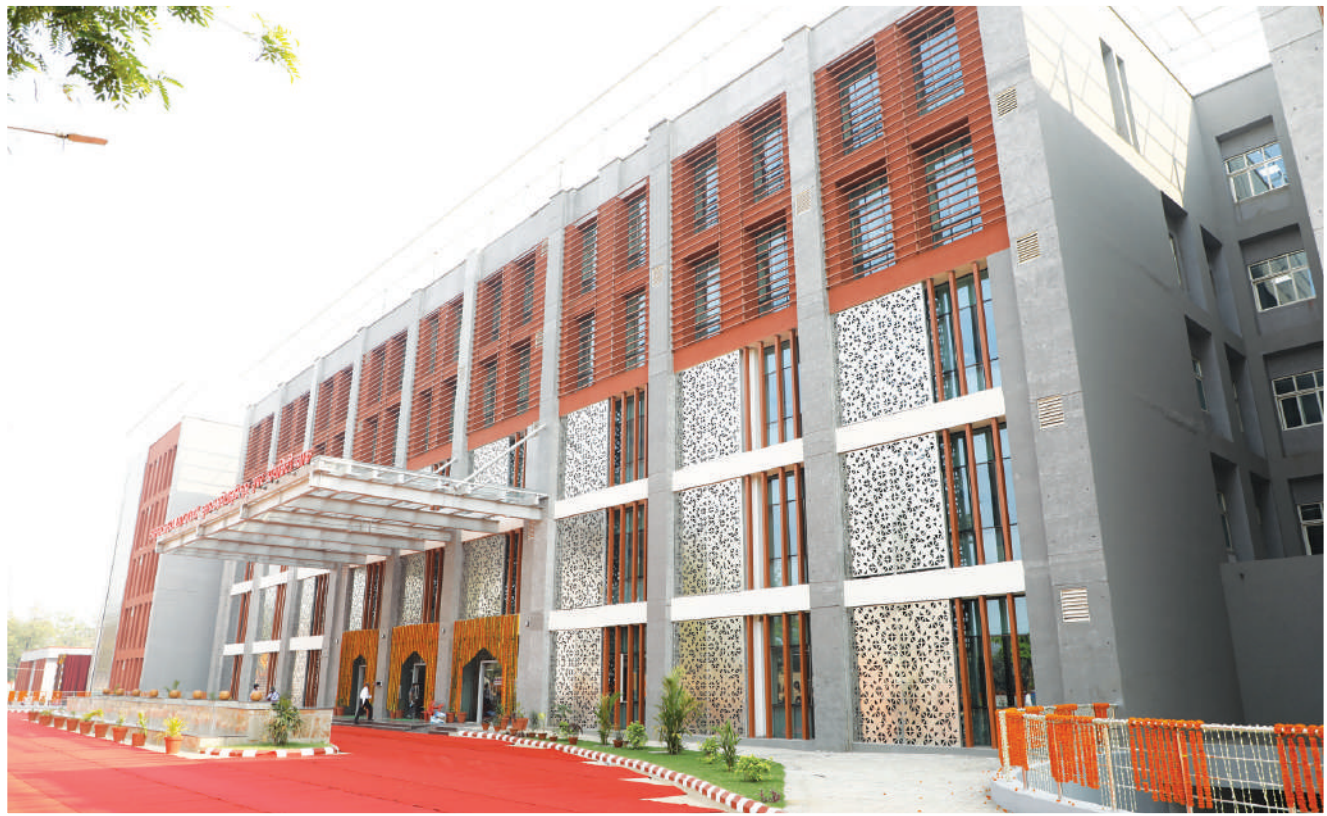
Super Speciality Hospital, Rourkela, Odisha