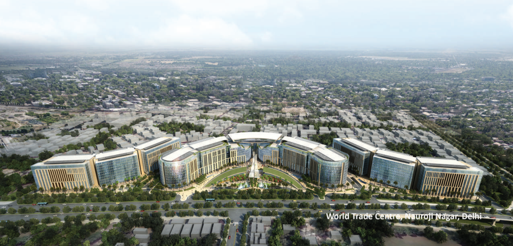
World Trade Centre, Nauroji Nagar, Delhi