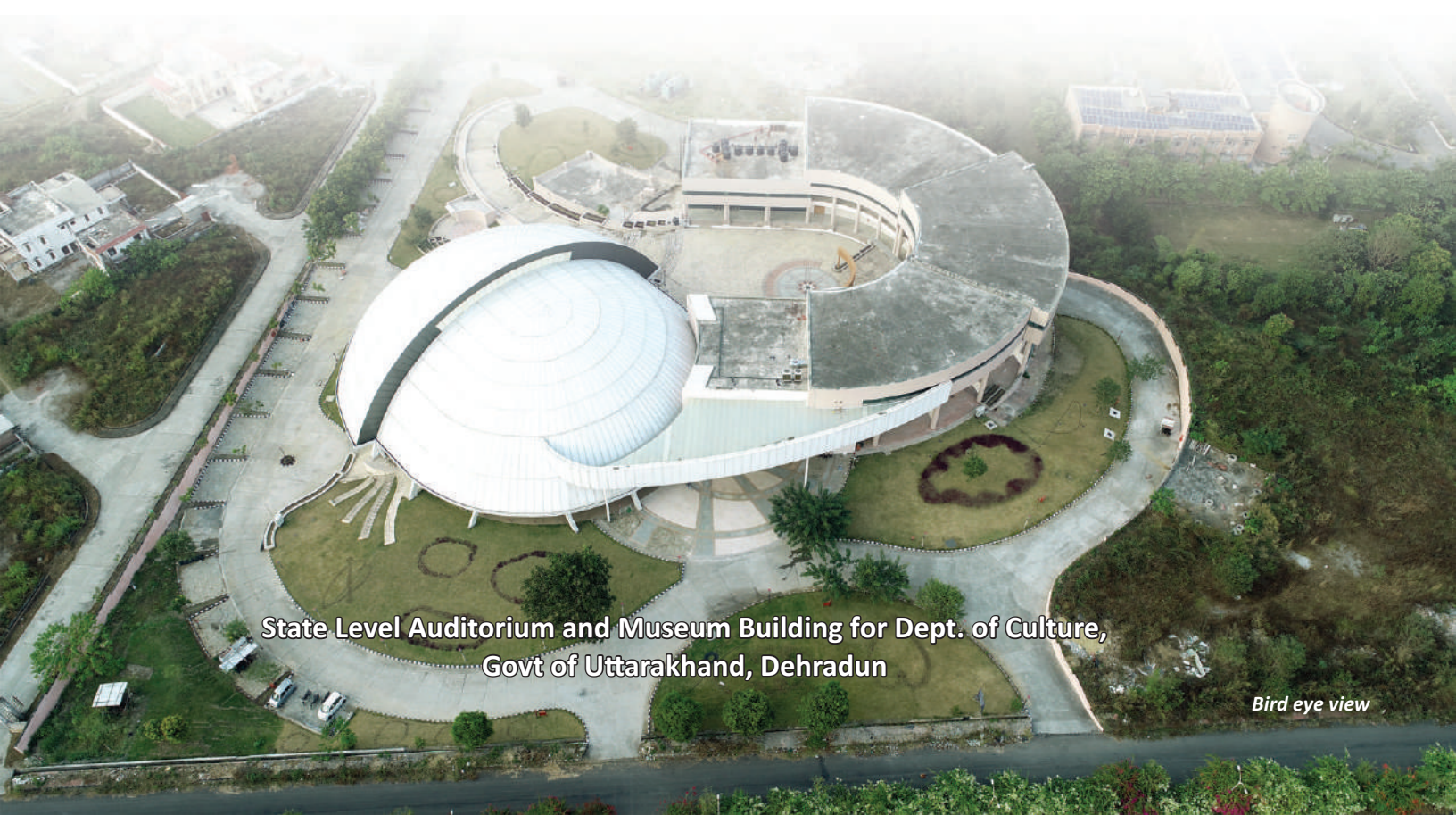
State Level Auditorium and Museum Building for Dept. of Culture, Govt of Uttarakhand, Dehradun