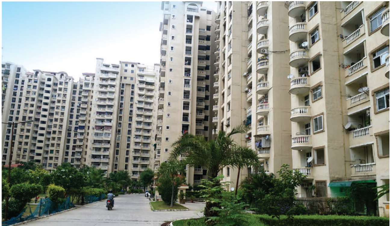
Silicon City, NBCC-Amrapali Projects, Noida