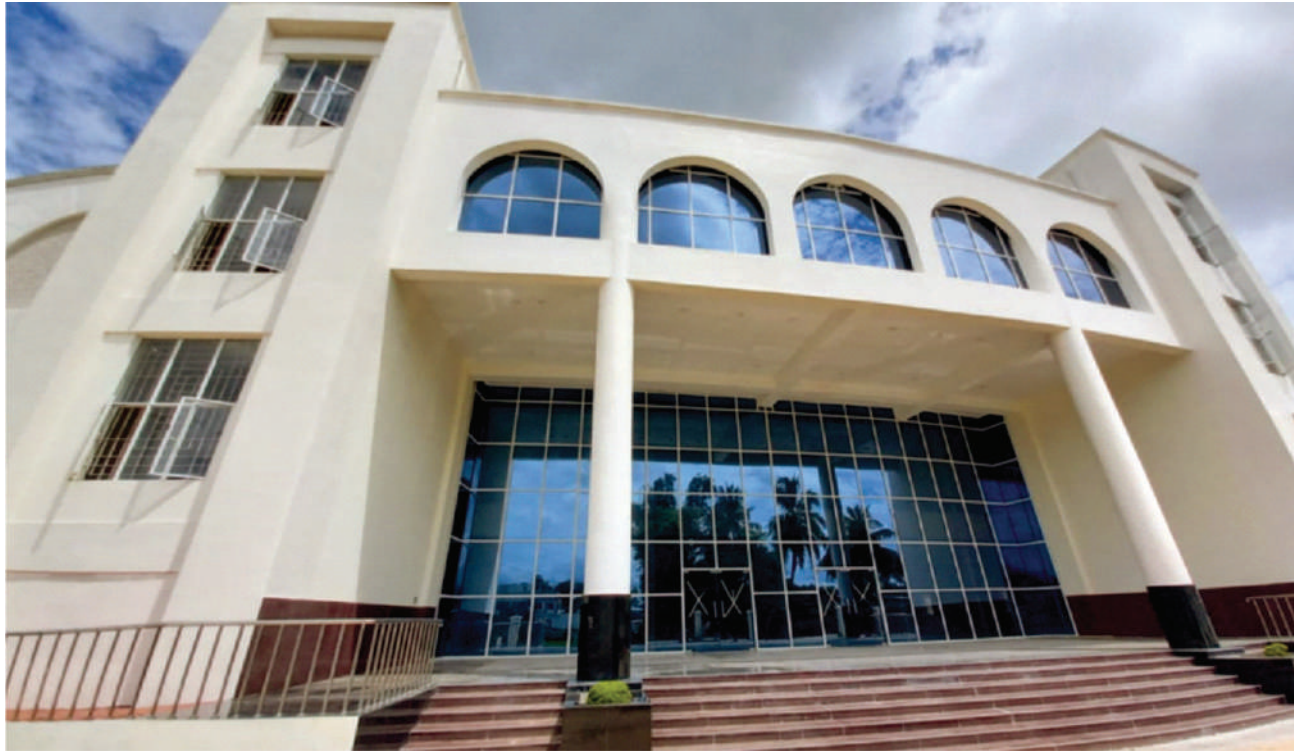
Townhall at Bishalgarh, Tripura