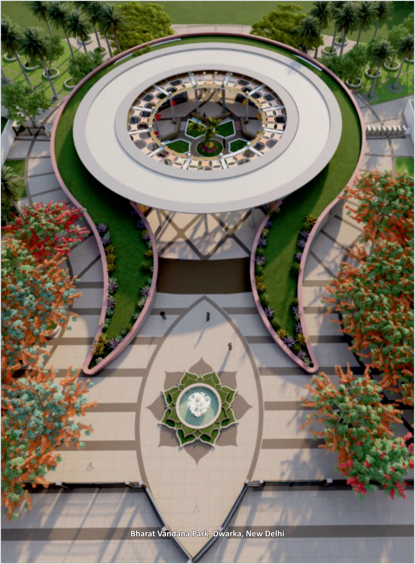
Bharat Vandana Park, Dwarka, New Delhi