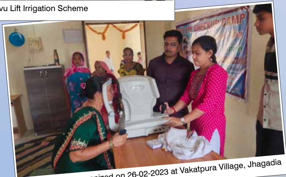
Free eye camp organized on 26-02-2023 at Vakatpura Village, Jhagadia