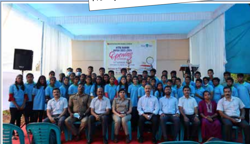
Inauguration of Nitta-Nanma Batch, 2022