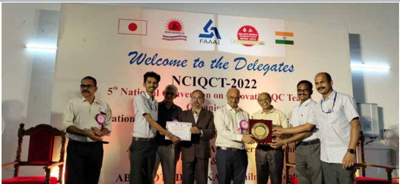
Rhodium Award in the 5 th National Convention on innovative QC Teams organized by the Alumni Society of AOTS