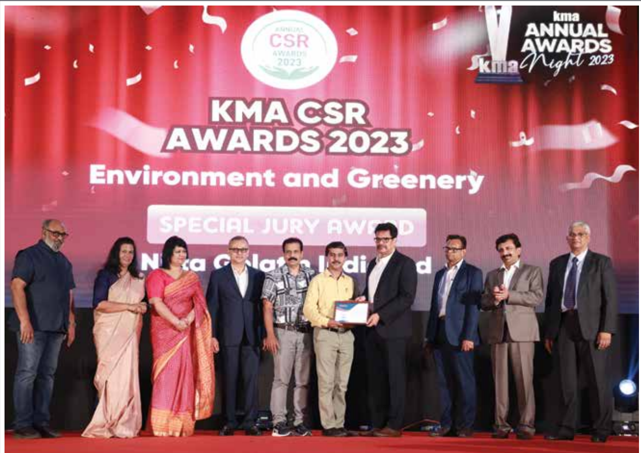
Receiving the KMA CSR Special Jury Award 2023 for Environment and Greenery