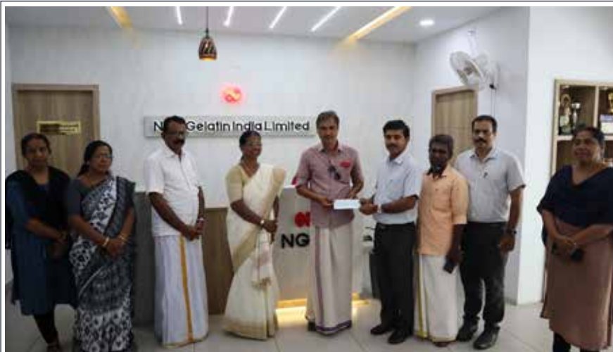
Extension of Iyyathukadavu Lift Irrigation Scheme