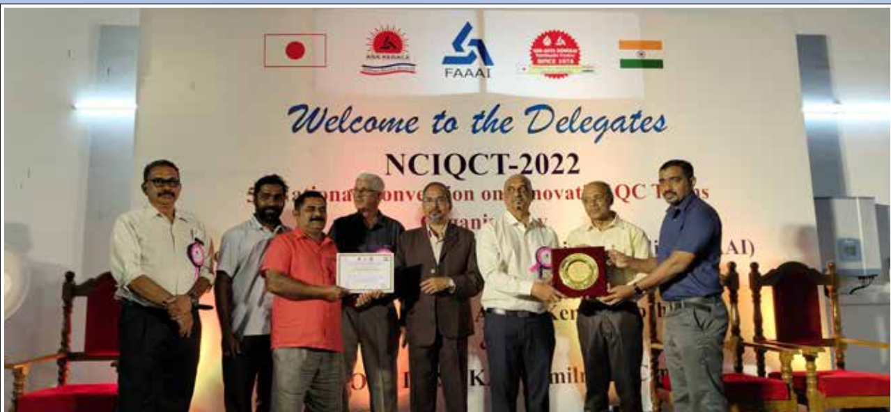
Gold Award received at the 5 th National Convention on innovative QC Teams organized by the Alumni Society of AOTS