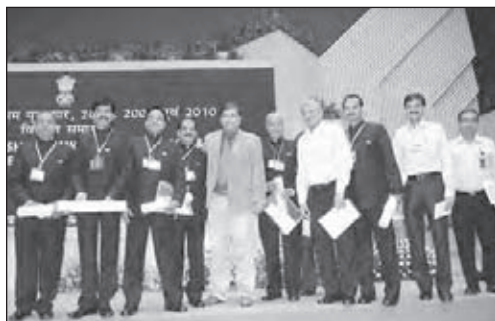
Six employees of NTPC conferred with the prestigious Prime Minister's Shram Award.

Your Company has been able to sustain its profitability despite the challenges affecting the Indian Power Sector. The net profit increased by 1% to ₹9,223.73 crore which is commensurate with the increase in revenue from operations excluding the impact of increase in the fuel cost. Your Company ranks 5 th among all the listed Companies in terms of Profit After Tax for 2011-12.