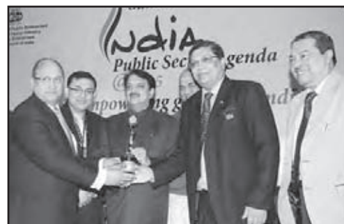
Receiving PSU Excellence Award, 2010 in the Best Financial Performance Category by Indian Chamber of Commerce.

Your Company is playing an active role in preserving and nurturing the rich cultural heritage of our nation. As part of commemorating the 150 th birth anniversary of Swami Vivekananda, your Company has provided support to