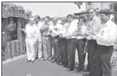
Shri Sushilkumar Shinde, Hon'ble Union Minister of Power, inaugurated the Solar Thermal Heating Ventilation & Air Conditioning at NTPC – NETRA.

Your Company has built strong partnerships with the communities around its projects and also with the wider society through