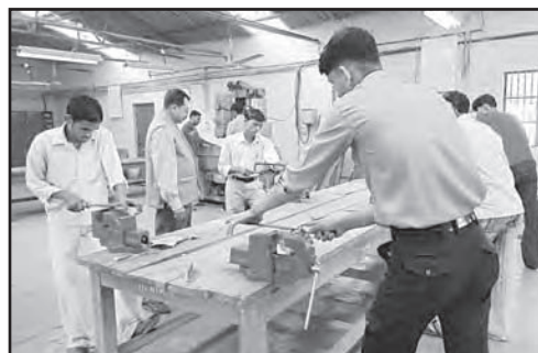
NTPC CSR Initiative : ITI Training