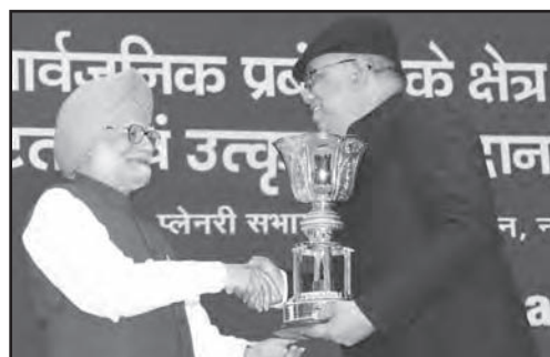
CMD, NTPC Ltd. receiving Scope Excellence Award (Gold Trophy) in Institutional category from Dr. Manmohan Singh, Hon'ble Prime Minister.

Your Company, along with its JVs and subsidiaries, has maintained its leadership position in the Indian power sector with 27.4% share of the total power generated in the Country during 2011-12. Your Company achieved a robust Plant Load Factor (PLF) of 85% for its coal projects as against the national average of 73.32%. The Company would have achieved still higher PLF but for the generation loss due to grid restrictions by the financially constrained customers. During the year, it achieved an average 'Availability Factor' of 89.5%. Your Company is committed to bring about continuous improvement in generation efficiency to maintain high standards of reliability through latest technologies and practices.