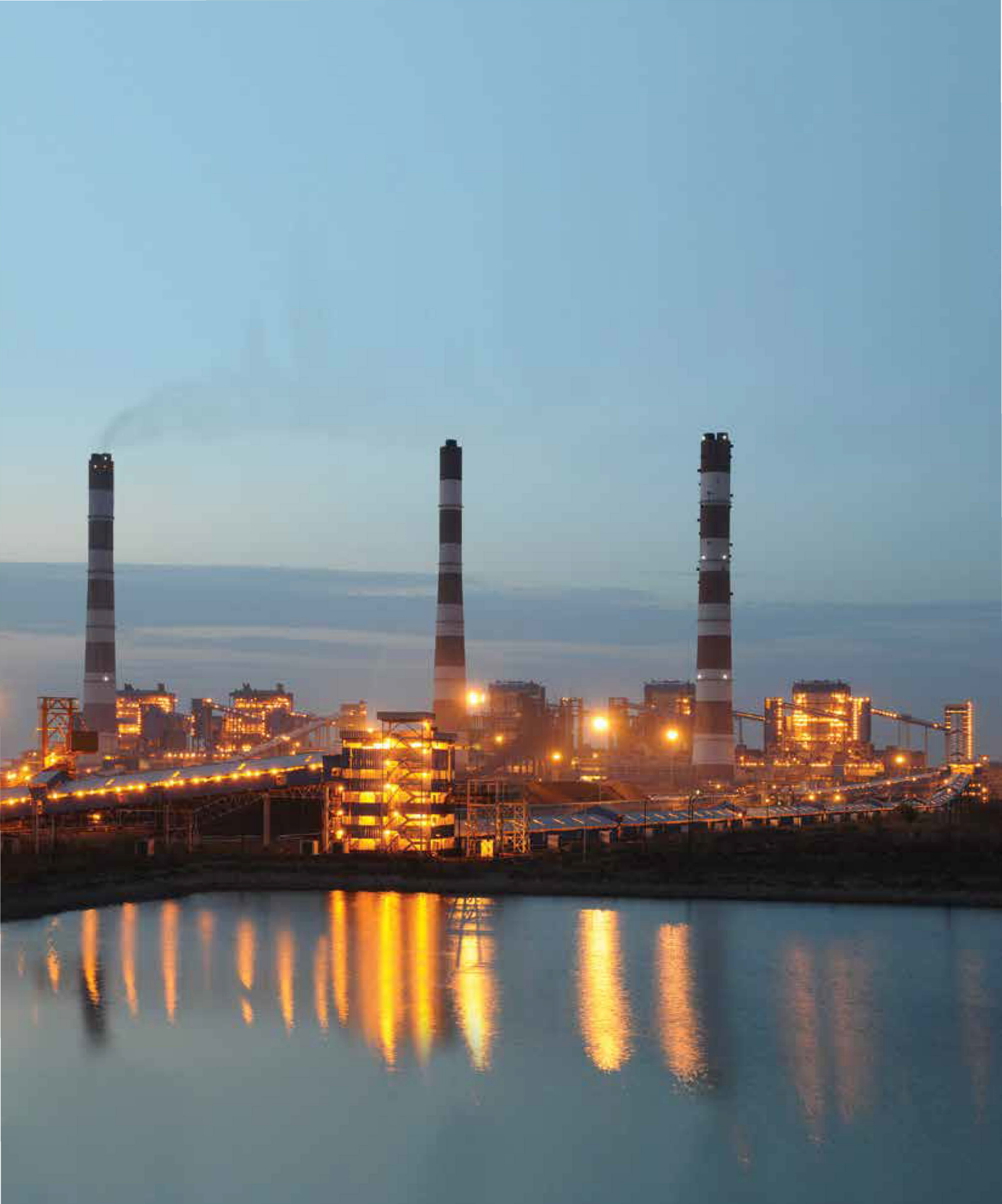
A View of NTPC - Sipat