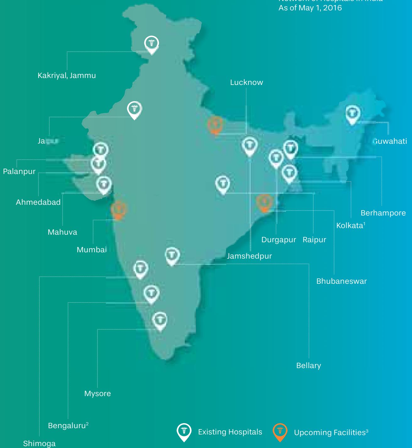
Network of Hospitals in India As of May 1, 2016