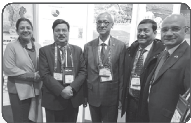
▲ NALCO in PDAC-2019