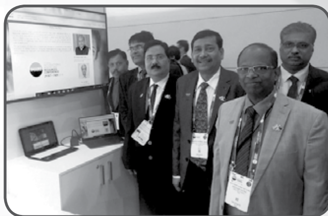
▲ NALCO in IMARC-2019