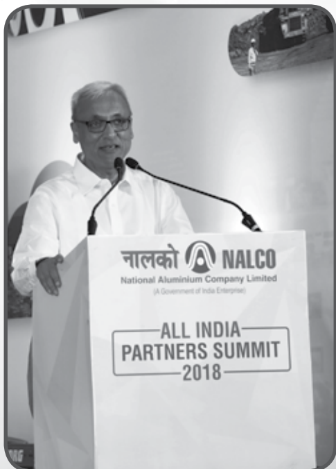
▲ All India Partners Summit