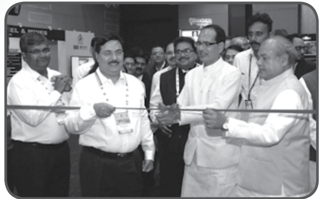
▲ Inauguration of NALCO stall at 4 th National Conclave on Mines & Minerals