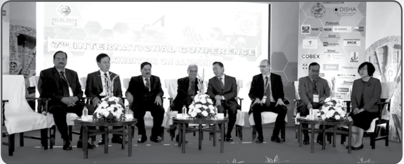
▲ Inaugural session of International Conference on Aluminium (INCAL 2019)