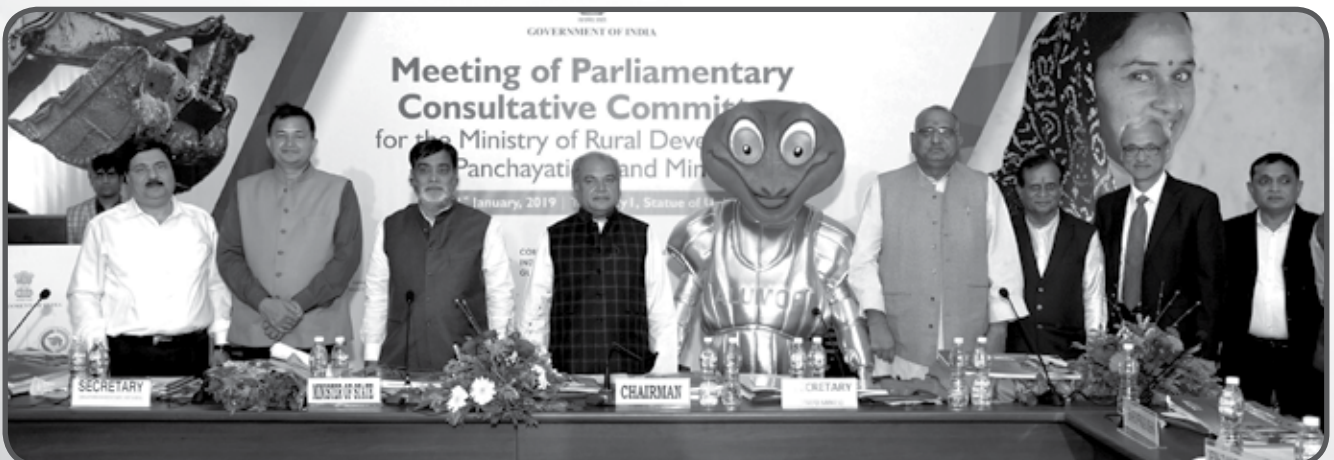
▲ Launch of ALUMOF-The Mascot of INCAL-2019