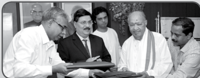
▲ MoU with Vrindaban Gurukul Trust