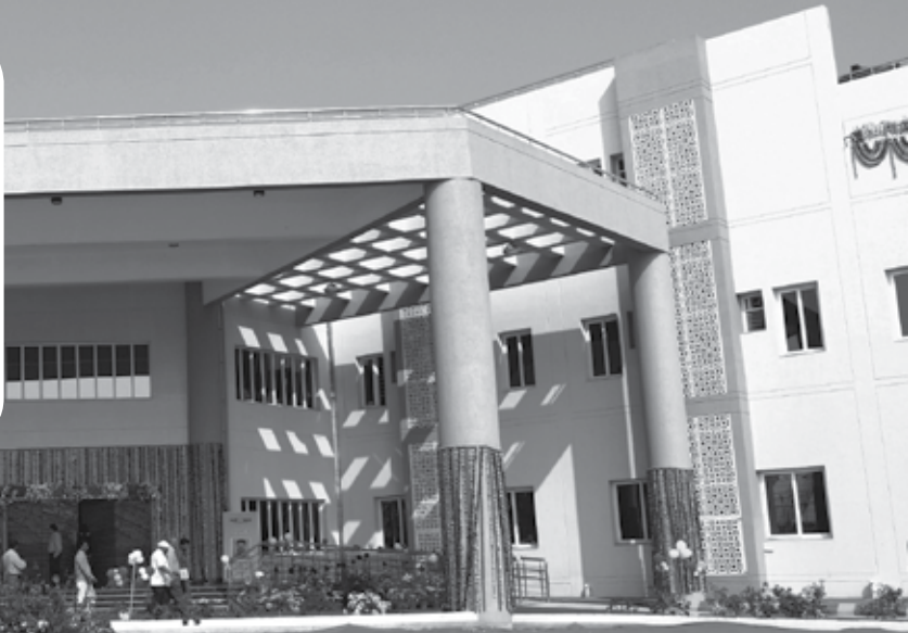
▲ Dedication of NALCO-LV Prasad Secondary Plus Eye Hospital at Angul