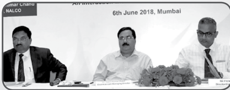
▲ Customers Meet in Mumbai