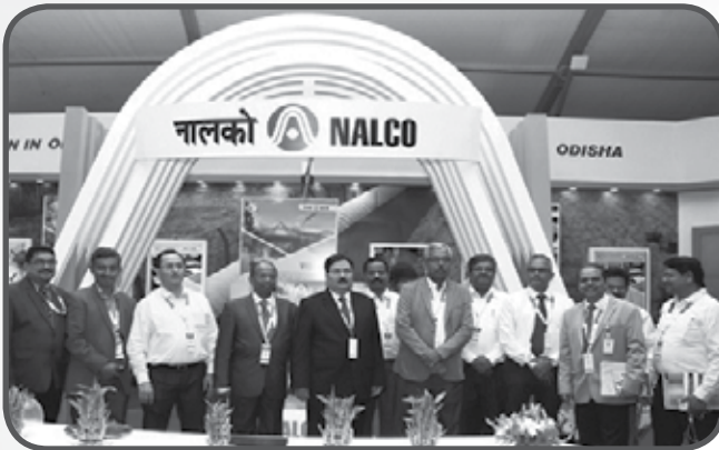
▲ NALCO Pavilion in Make in Odisha Conclave