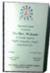
Jain Jagruti Center-Higher Education Project 2010