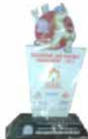
NITIE Cricket Cup 2010