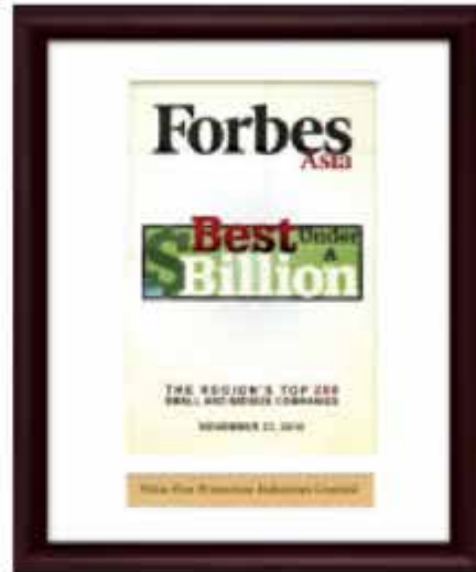
Forbes Asia best under a Billion Award, Consecutive Calendar Years 2009 and 2010