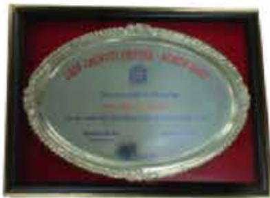
Shiksha Jagruti Abhiyan