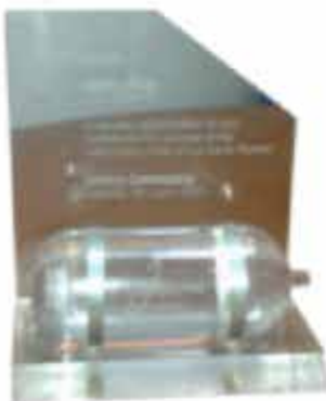
EUROCG successful Listing