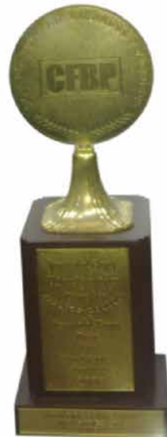
Life Time Udyog Excellence Award