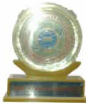
National Udyog Ratna Award