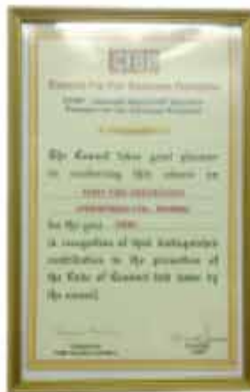
Award By Council for Fair Business Practices in the year 2006