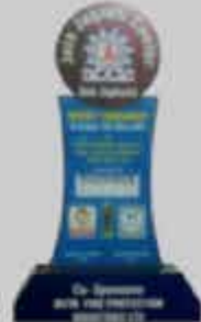
JJC Cricket Tournament