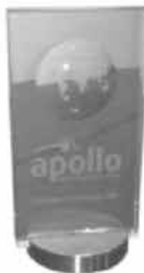
International Fire Expo - Honoured by Apollo