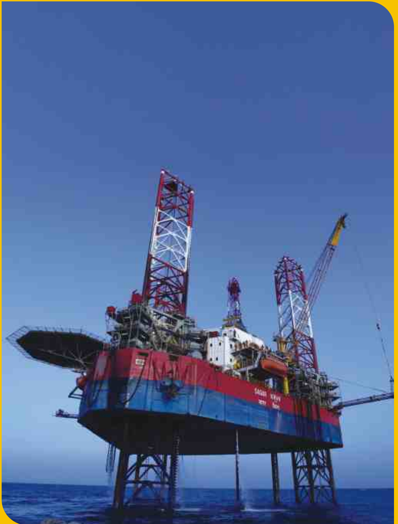
The steady workhorse at ONGC Offshore : Jack-up Rig Sagar Kiran