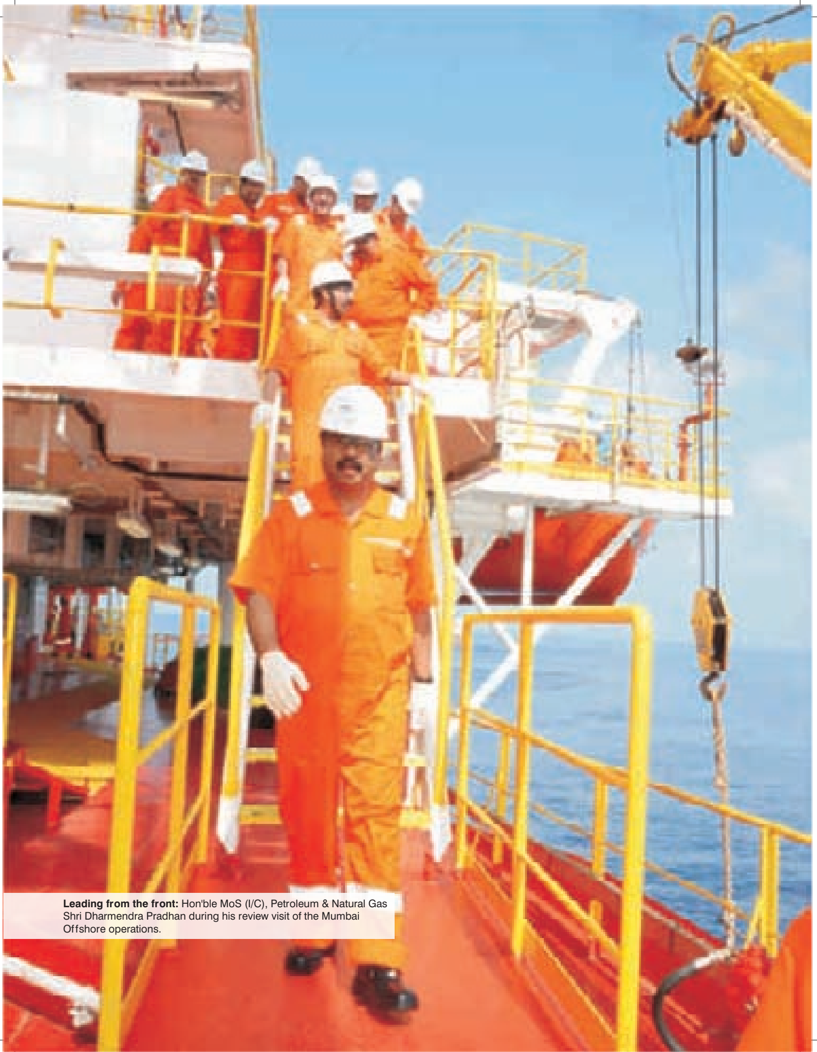
Leading from the front: Hon'ble MoS (I/C), Petroleum & Natural Gas Shri Dharmendra Pradhan during his review visit of the Mumbai Offshore operations.