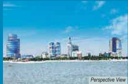
Omaxe Waterfront Hi-Tech City - Allahabad

insight into what our customers in these cities need and aspire for in order to develop offerings that are tailor-made for diverse set of customers in each of these cities like low-rise housing, developed plots, expandable villas, independent floors etc.