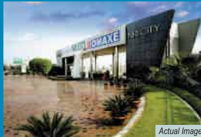
NRI City - Greater Noida