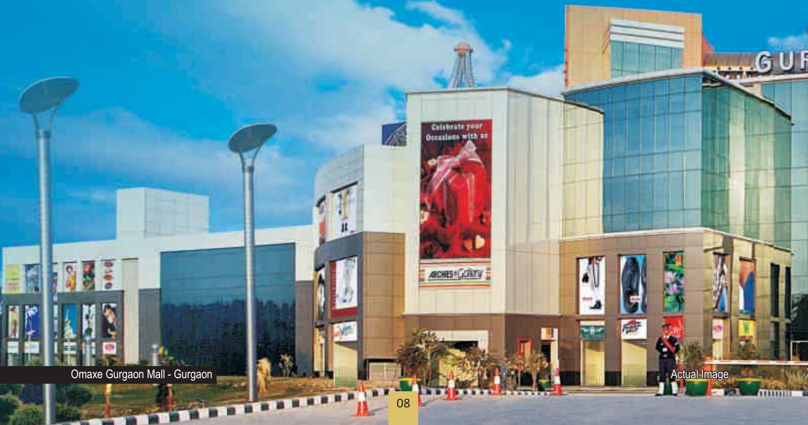
Omaxe Gurgaon Mall - Gurgaon

We have delivered 11 malls and commercial centers across various cities. At present 9 commercial centers/ malls/hotels/office spaces are under development. Some of the projects include Omaxe Square and Pearls Omaxe in Delhi, Omaxe Celebration Mall, Omaxe City Centre and Omaxe Gurgaon Mall in Gurgaon, Omaxe SRK Mall in Agra, Omaxe Plaza in Indirapuram (Ghaziabad), Omaxe Plaza in Ludhiana, Omaxe Mall in Patiala to name a few.