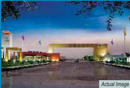
Omaxe City - Palwal