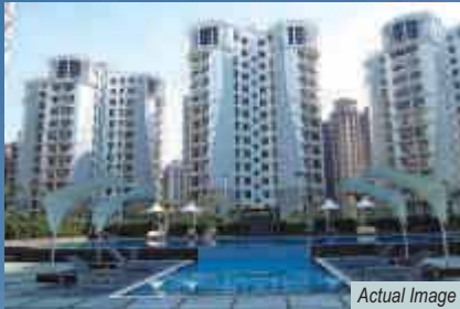
Omaxe Heights - Lucknow