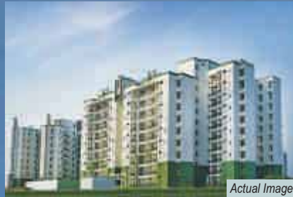
Omaxe North Avenue - Bahadurgarh