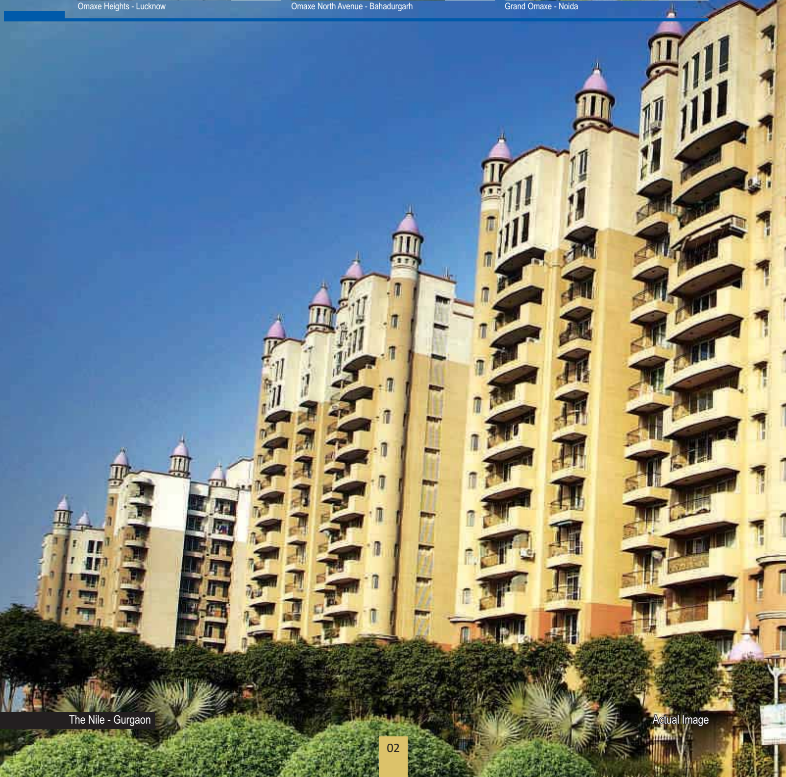
The Nile - Gurgaon