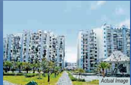
Grand Omaxe - Noida