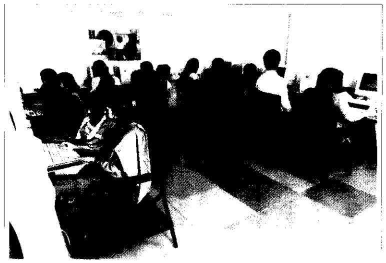
On - line Medical Transcription