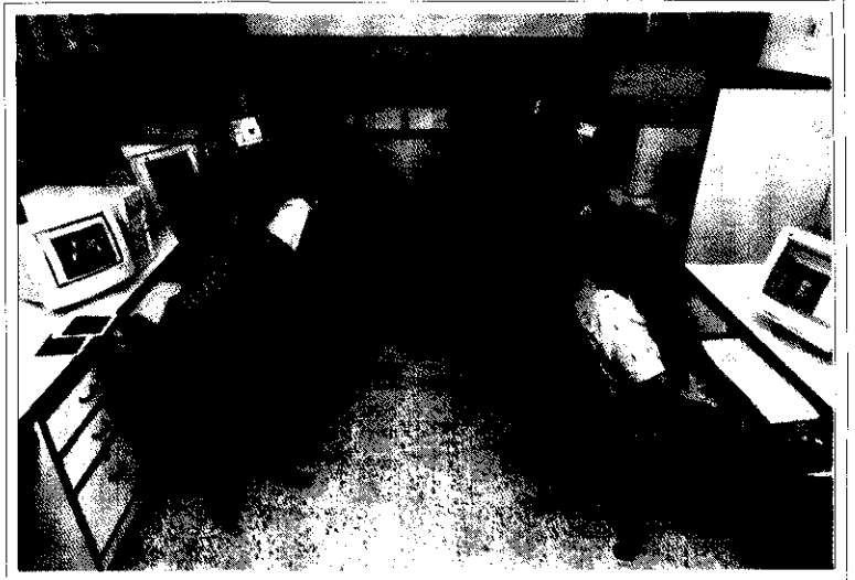
E - Commerce Solution Centre