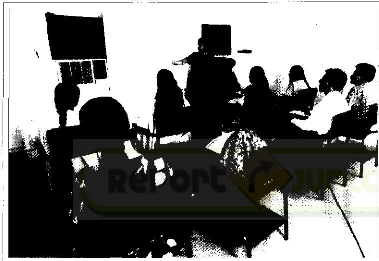
Medical Transcription Training Centre