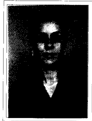
Business Development Director - U.S.A.