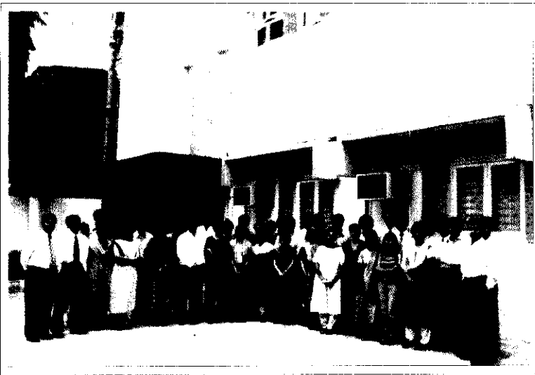
Omega Core Team