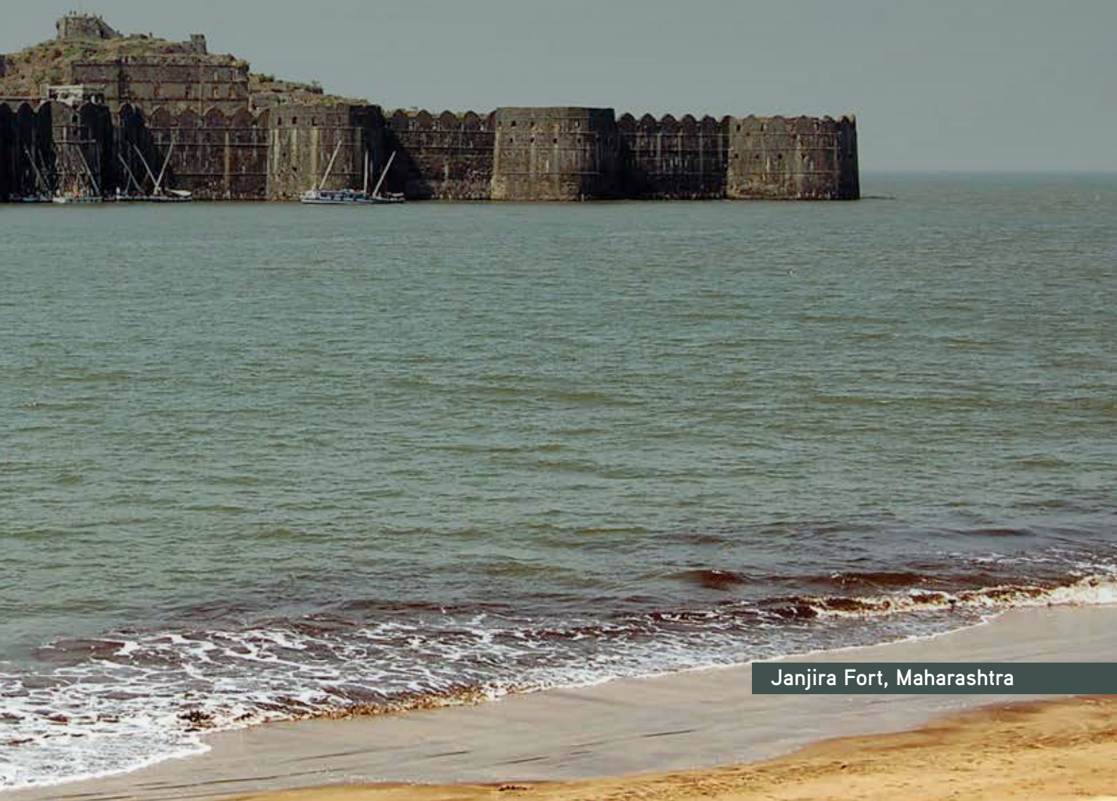
Janjira Fort, Maharashtra

A 17 th century architectural marvel that remained unconquered until India won independence. Janjira Fort is on an island, off the Arabian Sea, encircled by water from all sides. It epitomises ancient engineering and craftsmanship. This strongly resonates with the stable edifice of PNB Housing's capabilities and values that was built brick by brick with meticulous care and perseverance.