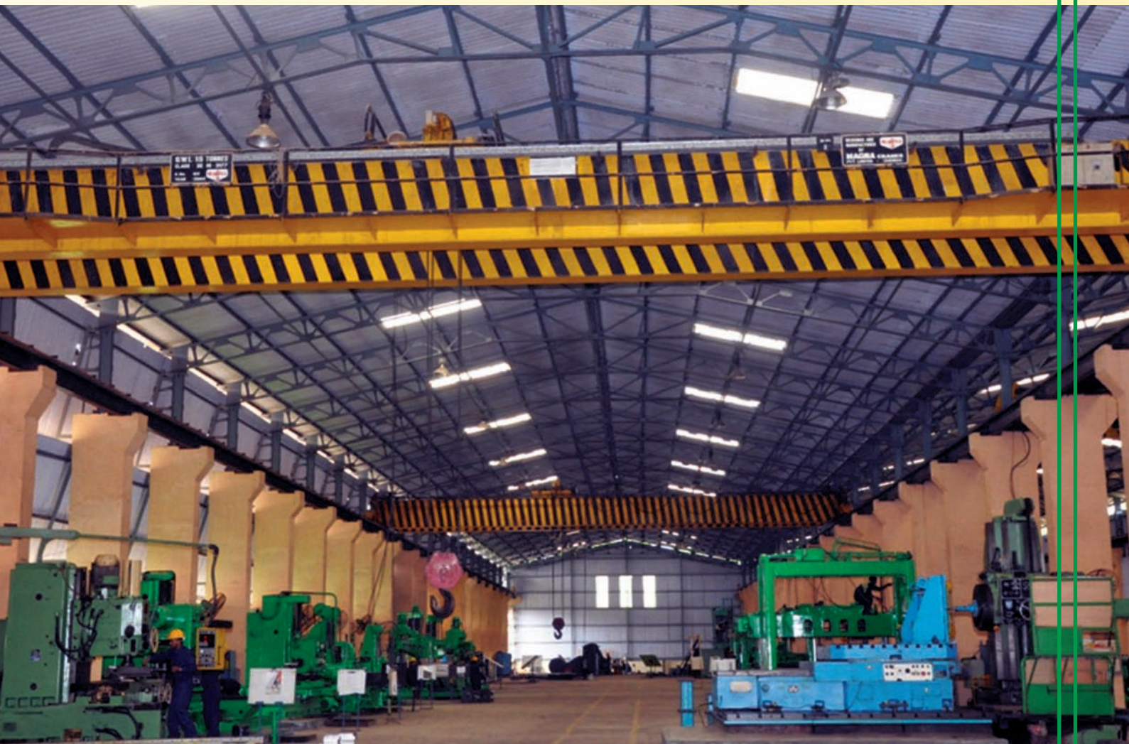
PSL's Machine Building Workshop - Daman

P SL Limited – a name to reckon with in the Pipe Manufacturing Industry of the country – is currently celebrating 25th year of its existence in the Indian Corporate World.