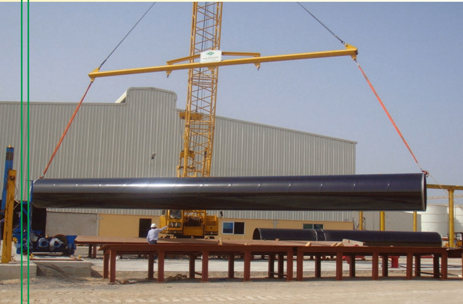
Extra Length Pipe for Structural Piling Application

The very fact that the Company has indeed embarked upon its expansion plans, coupled with necessary diversification in the related fields is adequate evidence of wide acceptance of Company's product namely HSAW Pipes manufactured by the Company at its various plants not only by leading Public and Private Sector Companies in India but even by renowned companies in different parts of the world in general and in US and in Gulf in particular