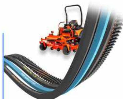
Lawn & Garden Belts