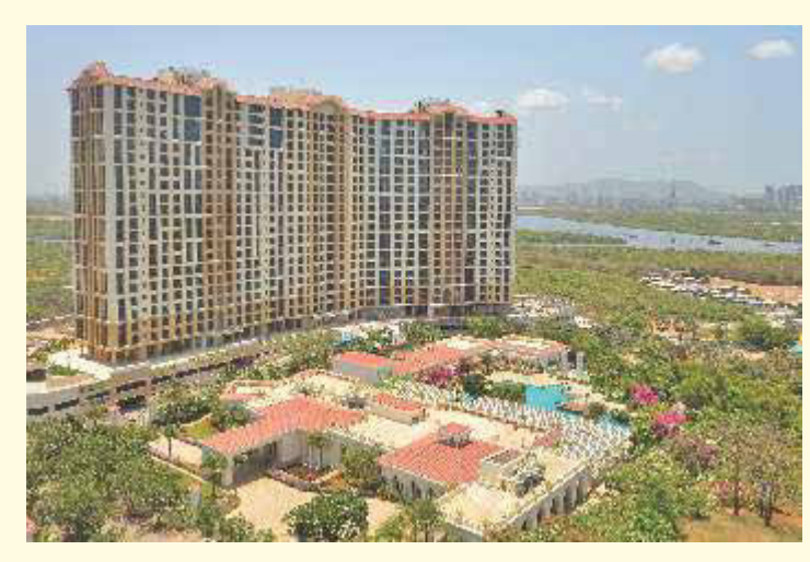
Sunshine Towers Dadar (Mumbai)