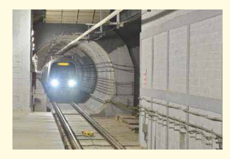
DMRC Mandi House Underground Metro Station

Arrival Terminal at IGI Airport, New Delhi