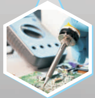
Standard Test equipment