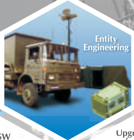
HW/SW development to meet customer specific requirements