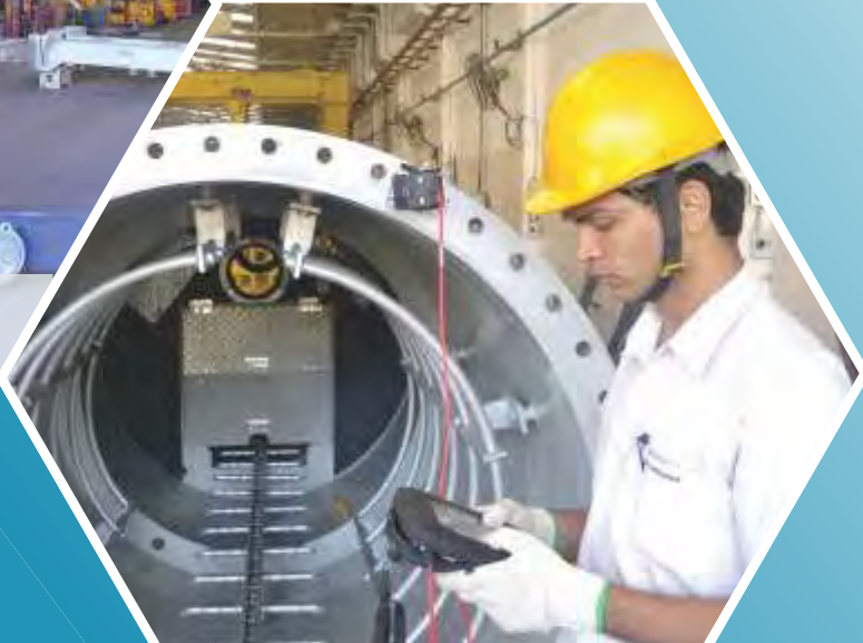
World class inspection facilities for Wind Mill Tower project