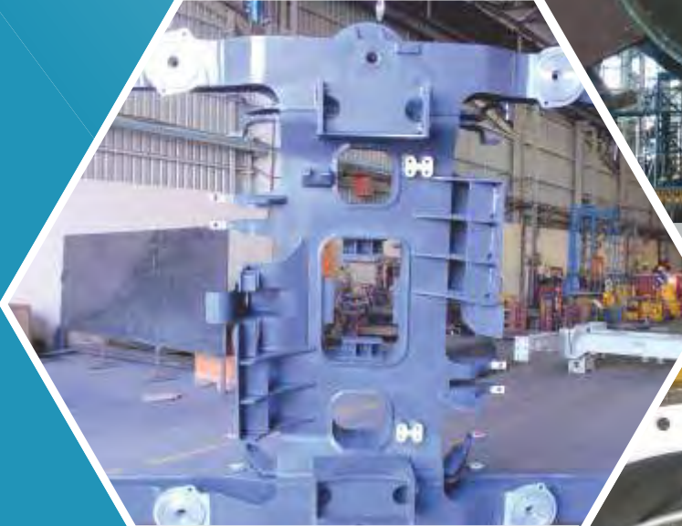
BEML Metro Bogie frame