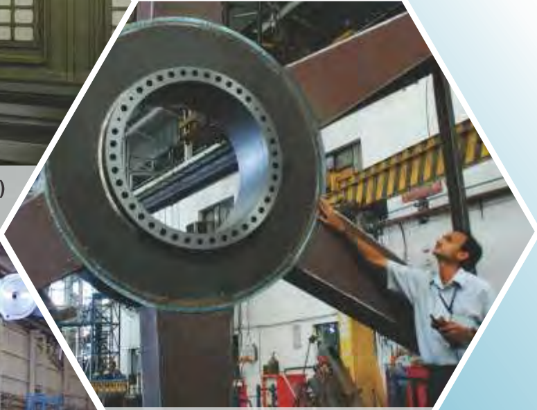
Manufacturing of Stator Carrier of Wind Turbine parts